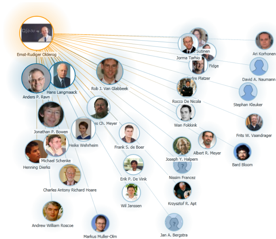
Fig. 3. Primary citing authors for Ernst-Rüdiger Olderog on Academic Search.