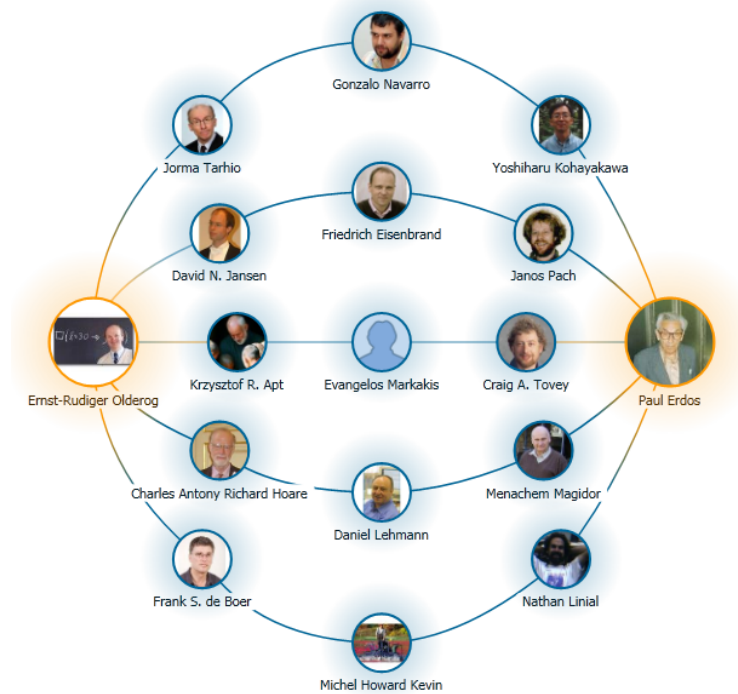
Fig. 4. A selection of connections with Paul Erdős for Ernst-Rüdiger Olderog on Academic Search.

manner, using a path of minimum length to determine the Erdős number when there is more than one path, as is typically the case for active researchers in the field.