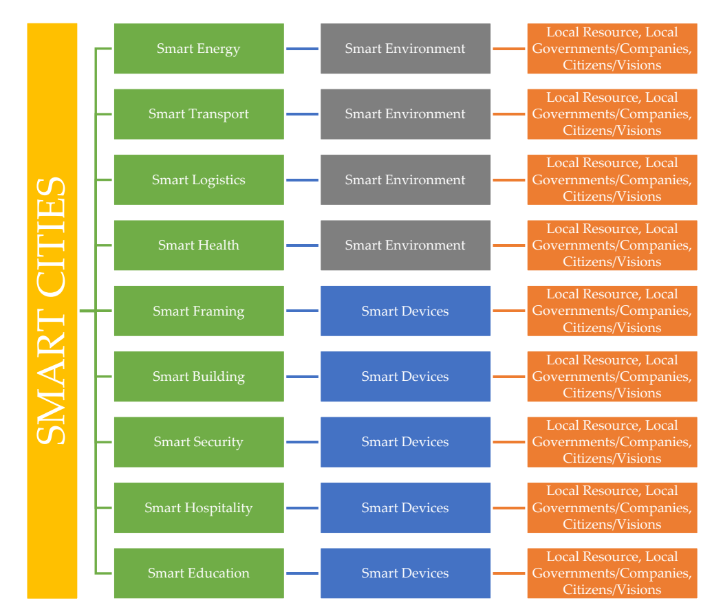
Figure 1. Shows the hierarchical structure of application areas related to smart cities [16].

Figure 1 shows the hierarchical structure of application areas related to smart cities. Additionally, Table 1 shows the previous investigations related to EVs and GBs by different researchers. As can see the key role of renewable energy for smart city development is significant in these studies.