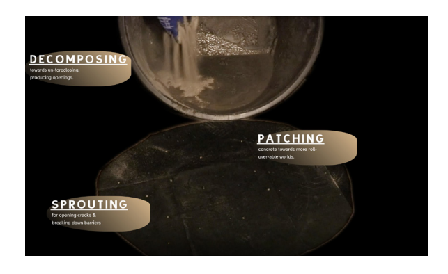
Figure 2: A screenshot from the online space shows a hand pouring concrete powder into a bucket that contains a brown mass of wet concrete. In the foreground, the banners of the website have the words "DECOMPOSING", "SPROUTING", and "PATCHING" written on them.

The next Meltry we share from our research is titled "C — Hacking Concrete". Hacking Concrete is an interactive online space that leads visitors through three storylines on patching, decomposing and sprouting with concrete. Concrete in its many states is visible, audible and readable in the footage that we display, and its materiality unfolds