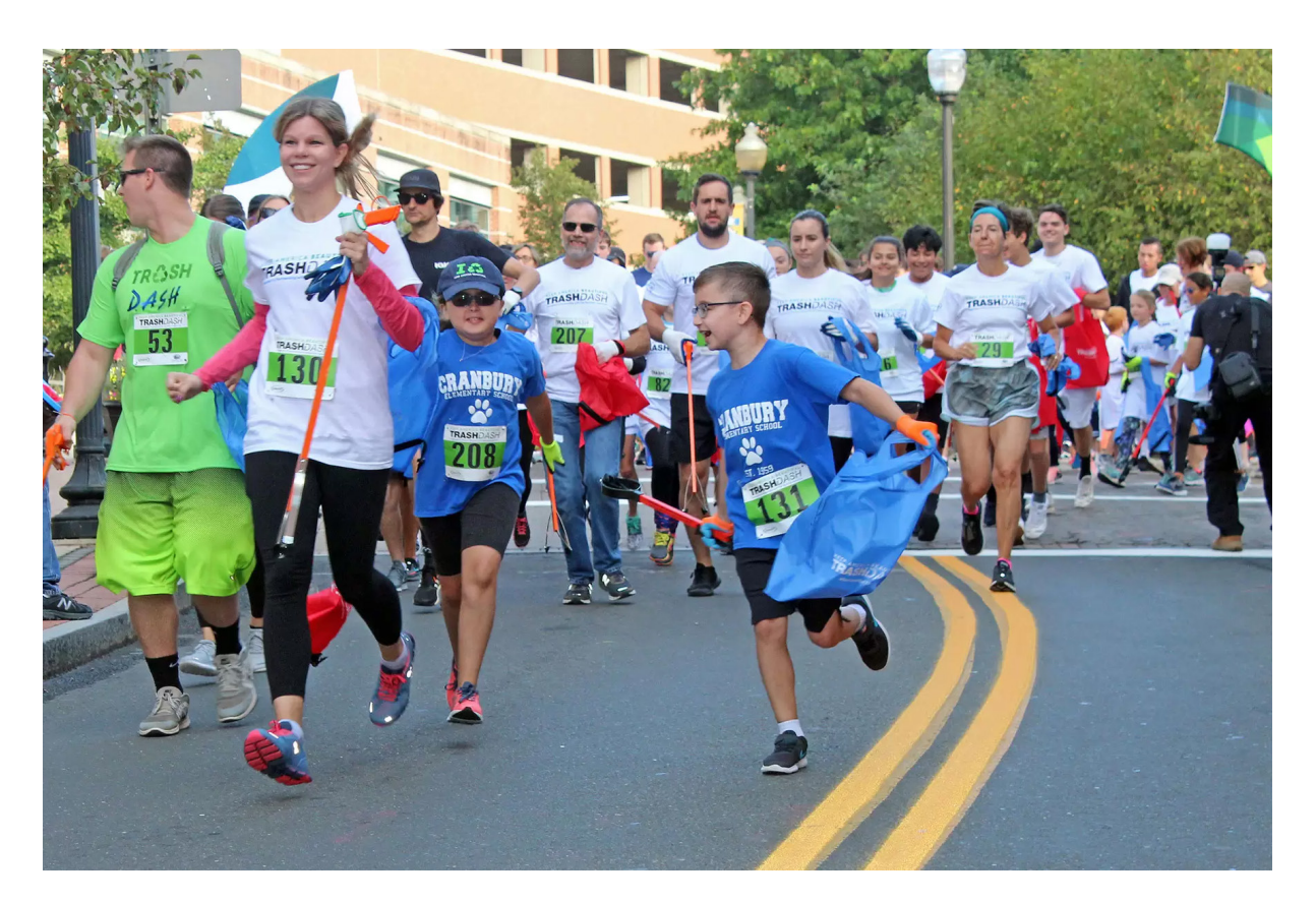
Figure 6: The start of the 2020 Trash Dash, a plogging fun run; Keep America Beautiful, Inc., 2020, Keep America Beautiful , https://kab.org/kab-events/trashdash/event/

100% renewable energy goal in late 2014 under public pressure. Yet, since then, it has expanded its data centre operations, but stopped all renewable energy investments after the 2016 wholesale electricity price dropped (Cook and Jardim 4).