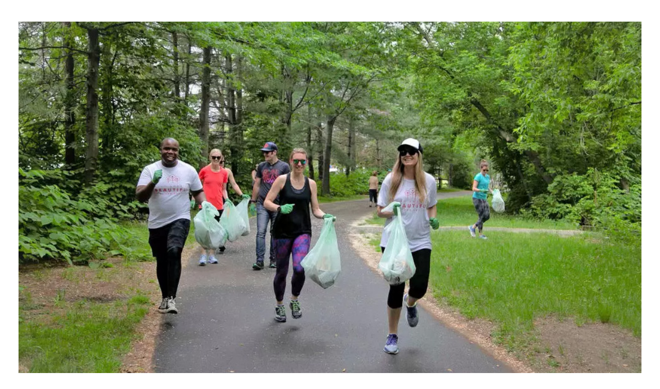
Figure 5: The Saucony and Keep America Beautiful Cleanup Run; Keep America Beautiful, Inc. June 2018, Keep America Beautiful , https://kab.org/keep-america-beautiful-plogs-with-saucony/

and 'dematerialization'. The third phase, Sustainable ICT, shifts its focus even more, emphasising the potential of ICT to not only improve sustainability, but also economic and societal issues in the countries that can afford this (ibid.). In practice this means other countries are burdened with the environmental footprint that the production of such ICT involves. There is no real distinction between Sustainable ICT and regular ICT practices. Green ICT can therefore be described as a business strategy used to gain a competitive advantage and its description matches Google, Amazon and Microsoft's 'sustainability' practices perfectly.