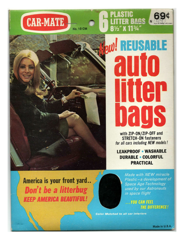
Figure 2: A photo of CAR-MATE plastic litter bags, meant to stop plastic littering, with slogans from the Keep America Beautiful campaign

is constantly being sensed by IoT devices, needs the rapid processing that ML can provide (Zhou et al. 1742-1743). Not only is ML very resource intensive, it requires edge devices to be equipped with some form of Al accelerator. This has two consequences: an increase in electricity consumption and an explosion of newly produced devices, and consequently e-waste, because older end-node devices aren't compatible with services using ML. In certain IoT settings, edge computing means micro data centres are required in between end-nodes and data centres, to decrease latency for devices that are too resource constrained to perform heavy computation on large datasets themselves. These 'data centres in a box', similar to the previous example, mean another increase in electricity consumption and newly produced hardware.