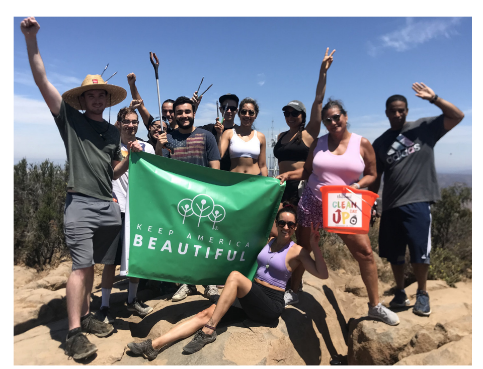
Figure 7: A group of enthusiastic Keep America Beautiful volunteers during a 2021 cleanup; Nelson, Ben, Cleanup group for Keep America Beautiful, 2021, Wikimedia, https://commons.wikimedia.org/wiki/File:Keep_America_Beautiful_Cleanup_Team.jpg.

used. We are still reaping the rewards, picking up after ourselves, updating our hardware, lowering the thermostat, hiding our messy office behind a virtual background.