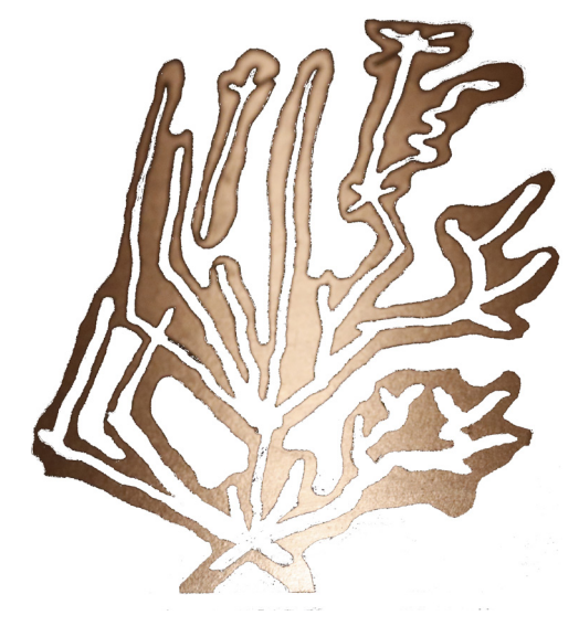
Figure 5: A cascading structure has been etched from a copper board and additionally been cut out in Photoshop so that just the tree shape appears as if surrounded by copper.

A soft error is an error that doesn't imply that anything is wrong or unreliable about the system that the error occurs in. Soft errors are common, expected, and often caused by cosmic rays. As soft errors happen because of cosmic ways of refusing the binary, they are already working towards non-binary computing. In common computer systems, these interruptions are only possible to be understood as "soft" errors because there is no other legibility for them encoded into technical devices. We attend to these soft errors and wonder: what if problems were not registered as errors but rather as potentials for change? (Ahmed)