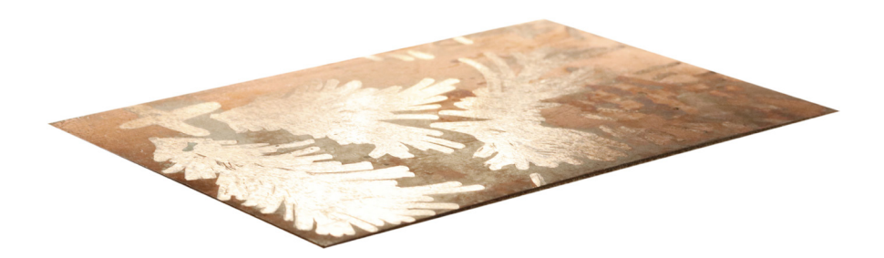
Figure 6: On a copper board photographed from an angle, multiple treelike structures, the non binary trees, have been etched away. They are more shiny than the rest of the copper.

Non binary trees draw their shapes from particle tracks of cosmic rays. Unlike computational binary trees, which usually split into twos or multiples of twos, the non binary tree has no definite shape. After traveling through space, cosmic rays meet the Earth in patterns that are called cascades or showers. At this point, cosmic rays split into electromagnetic, hadronic and masonic components (Heck) that have shifting, unstable and multiple fractures. We read these cosmic ray cascades as non binary trees that create figures for accounting towards unstable and multi-temporal realities in computing. Etching their shapes into copper boards, we created messy connections and short circuit currents.