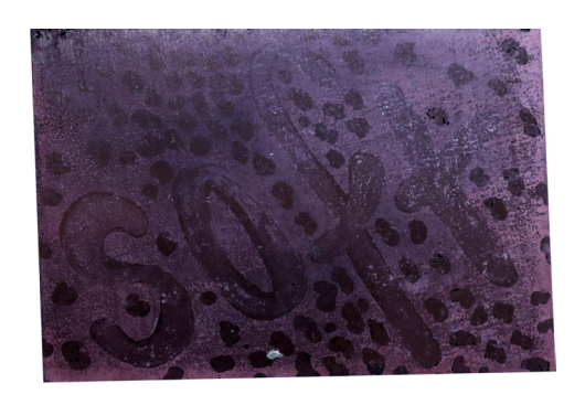
Figure 4: The word "SOFT" is lightly etched into a copper board.

We found an accomplice for this work in cosmic rays. Cosmic rays cause trouble with electronics: as high energy (often hydrogen) atomic nuclei, they escape the solar systems of collapsing supernova stars and speed through space at the speed of light. Entering the atmosphere of Earth, cosmic rays interfere with the binary state of computational bits and mess with memory and processing. In processes called bitflipping, a zero is turned into a one and vice versa. Cosmic bitflips occurred in the 2003 elections in Brussels, Belgium (Adler) where 4,000 more votes were cast for the communist party, than there were people in that city district. This example leads us to the conclusion that the universe is not okay with binary logic; and thus we are joining the universe in pursuing non-binary ways towards post-binary computational futures. To do so, we pursued conducive etchings on printed circuit boards (PCBs) that follow waves of inquiry towards non-binary computing.