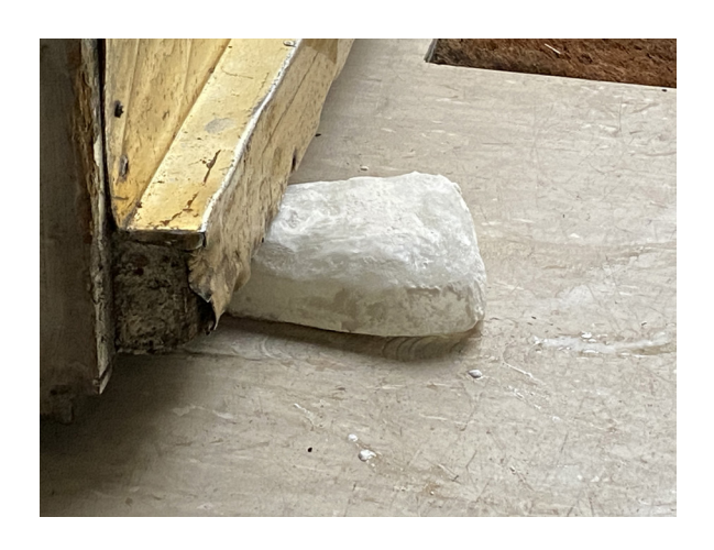
Figure 1: An ice wedge is inserted underneath a metal doorframe on a grey floor. The wedge holds the door open.

technically "open". The melting process left behind water and playdough residue and stains, traces and water puddles leaked all over our floor. To create snow wedges, we formed snow into triangular shapes with our hands. Our touch condensed and slightly melted the snow, making it possible to fuse differently dense wedges while feeling the tingling that the cold material in our hands evoked.