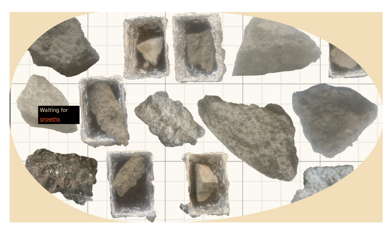
Figure 3: Dried chunks of concrete are displayed on top of a grid. Some of the chunks are inside of rectangular boxes filled with dirt, like they have been planted.

Hacking in this project is a way of practicing crip and trans*feminist intervention towards worlds that are more accessible and joyful. Micha Cárdenas suggests hacking as a political project combining "technological creativity and imagination with activist campaigns and projects" (Tanczer). In line with Remi. M. Yergeau's emphasis that "Bodies are not for hacking. Bigotry is." ("Disability Hacktivism"), we hack bigotry by playfully refusing seemingly closed systems such as the hardened concrete structures of the built world. In Hacking Concrete we practice with modes of examining, remixing and studying (Empowermentors Collective) with the aim of refusing and subverting ableism.