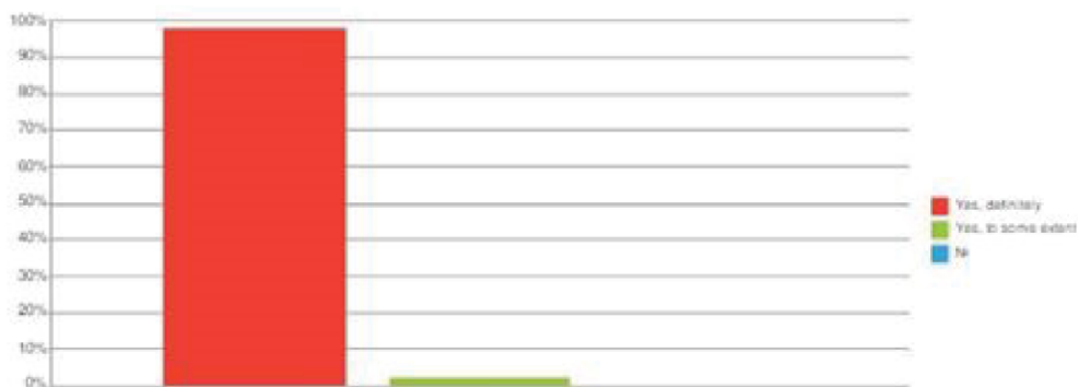
Figure 3 Involvement in care and treatment decisions. Ninety-eight percent of the respondents were satisfied with JET involvement in their care and treatment.