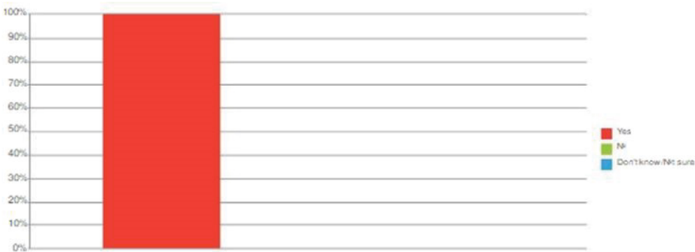
Figure 2 Has your appointment with the JET team been helpful today? One hundred percent of respondents view their appointment with JET as beneficial.