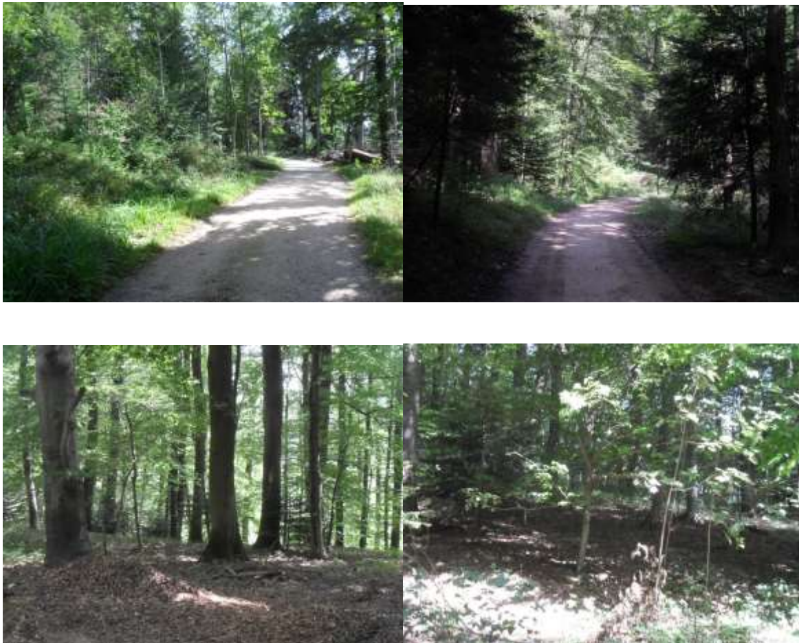
Figures 1-4. Views of the Nature Environment.

The school has public woods with nature trails within 500 meters which was utilized for the walk. It is heavily forested so when on the nature trails, only natural elements are experienced; the woods are far enough away from any highways that no noise external to the woods can be heard (see Figures 1-4).