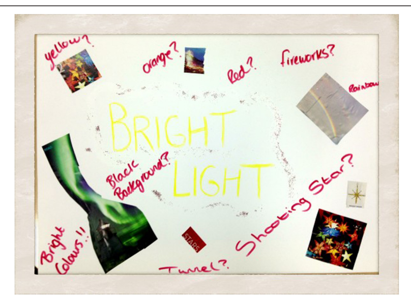
Figure 3 BRIGHTLIGHT mood board used for the logo design.

made. However, despite lower than anticipated recruitment so far the refusal rate to BRIGHTLIGHT is less than 20%, versus an anticipated 35% which was based on refusal/consent rates in other published TYA cancer studies [11-13].