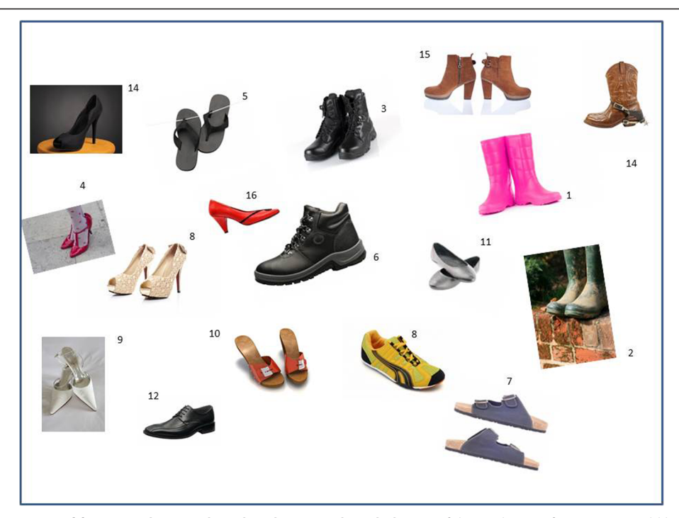
Figure 2 Representation of footwear character board to determine brand identity. If the study were footwear it would be a pink Wellington boot (readers can contact the authors for the original board used). Footnote for Figure 2: Copyrights for Figures. 1. Image by Phaitoon at FreeDigitalPhotos.net; 2. Image by Simon Howden at FreeDigitalPhotos.net; 3. Image by posterize at FreeDigitalPhotos.net; 4. Image by africa at FreeDigitalPhotos.net; 5. Image by John Kasawa at FreeDigitalPhotos.net; 6. Image by John Kasawa at FreeDigitalPhotos.net; 7. Image by artur84 at FreeDigitalPhotos.net; 8. Image by bigjom at FreeDigitalPhotos.net; 9. Image by Sharron Goodyear at FreeDigitalPhotos.net; 11. Image by artur84 at FreeDigitalPhotos.net; 12. Image by John Kasawa at FreeDigitalPhotos.net; 13. Image by Boaz Yiftach at FreeDigitalPhotos.net; 14. Image by Gualberto107 at FreeDigitalPhotos.net; 15. Image by artur84 at FreeDigitalPhotos.net 16. Image by bigjom at FreeDigitalPhotos.net.

A recap of the results from STAGES 1–3 was given and young people worked in their groups to generate suitable names for the '2012 TYA Cancer Cohort Study' taking