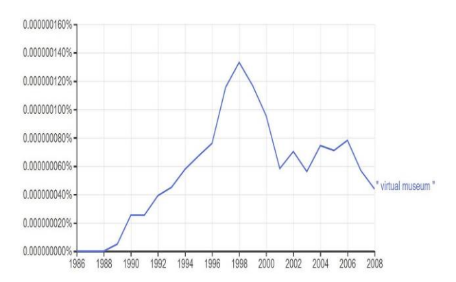
Figure 3: Use of the term "virtual museum" in books, 1988–2008 (Google Books Ngram Viewer).

Viewing the use of the term "virtual museums" in books using the Google Books Ngram Viewer (<a href="https://books.google.com/ngrams">https://books.google.com/ngrams</a>), we can see that the phrase started use around the birth of the web and peaked in 1998 (see Figure 3).