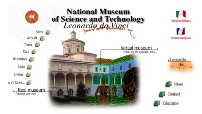
Figure 4: The 1999 home page of the Science Museum of Milan clearly shows the deep relationship between the "Real" and "Virtual" Museum.

At the Science Museum of Milan [see Figure 4] we decided to put ourselves between the second and the third approach – we were not trying to simulate any real visit, but we wanted the website as an instrument to prepare and deepen the actual visit – while we had also some sections independent from the actual museum."