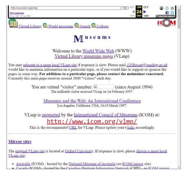
Figure 6: VLmp main page on the ICOM website in 1997. (Archived on Archive.org, 24 June 1997.)

In 1996, the International Council of Museums (ICOM) adopted VLmp as its official online museums directory and hosted the resource on its own website (Bowen 1996a). Figure 6 shows the main VLmp page on the ICOM website in 1997 and Figure 7 show the same page in 2006.