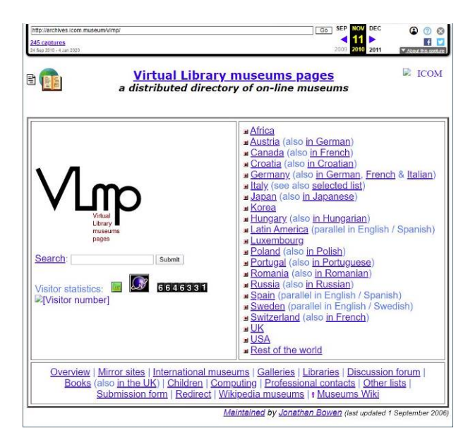
Figure 7: VLmp main page on the ICOM website in 2006. (Archived on Archive.org, 11 November 2010.)

The countries with their own separately maintained entries can be seen in Figure 7. It is interesting to note both the countries and continents that were involved as well as those that were not involved. This is left as an exercise for the reader! At its height, about 20 people around the world were involved with the maintenance of VLmp.