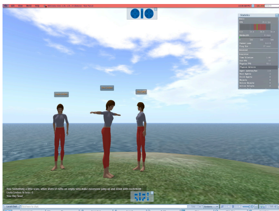
Fig. 7 "At about 11:00 AM, Linden, Ruth arrived on an OpenSim server, quite quietly."

"All three Avatars had been logged on via the Agent Domain in the Linden Lab Aditi test grid. The Agent Domain took a "place_avatar" request from the client, and issued a "rez_avatar" request to the OpenSim, which handed the Agent Domain the necessary details so it could relay it to the client, and permit a login. We're all Ruth, because we're not yet syncing the agents with openSim inventory yet. That's just a small matter of programming... (Well, that's what we programmers always say.) We have no inventory, and we're stuck on the single region. But... it's a very nice first step."