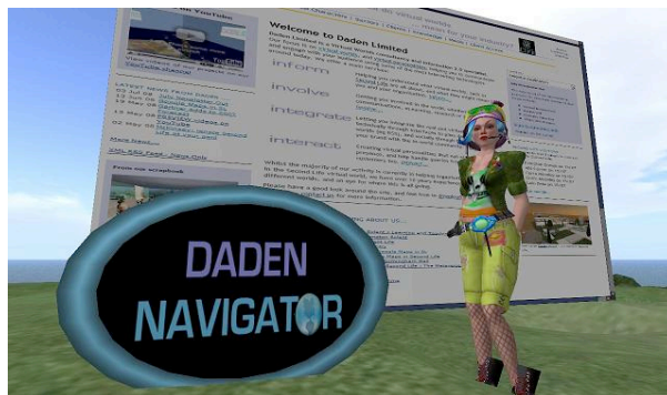
Fig. 8 The Daden Navigator (launched July, 2008)

A recent innovation has been the development of a browser which residents can use in Second Life to access the internet 'in-world'. This, in effect, will create an intellectual doorway through the 'membrane' around the world.