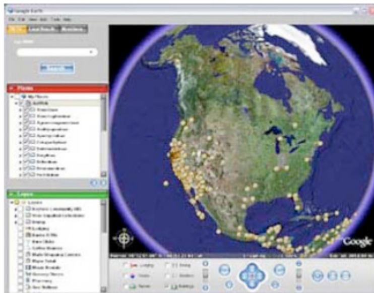
Fig. 2 Google Earth Home Screen, N. America

The first category is virtual worlds, which are discussed in this report. The second category tipped for steady growth is Mirror Worlds, informationally-enhanced virtual models or 'reflections' of the physical world which incorporate mapping, modelling and annotation tools, plus geospatial sensors and other location-aware technologies. Mirror Worlds may also offer what they term 'lifelogging' facilities – the third category – that are the ability to record the history of an activity. An example would be Google Earth and the way it is providing an increasingly annotated image of the world.