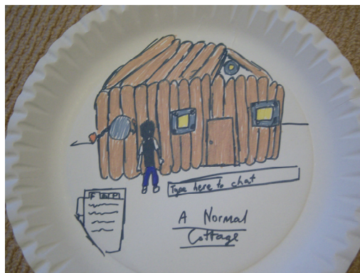
Fig. 6 "A Normal Cottage" (from the London 9-11 year old group)

Ten percent of the children drew a home, cottage, tent or hotel for their avatar during the second workshop when they were asked to draw something they would like to see in Adventure Rock if they were the producers. The girls often drew houses or bedrooms and the boys sometimes drew dens or tents: