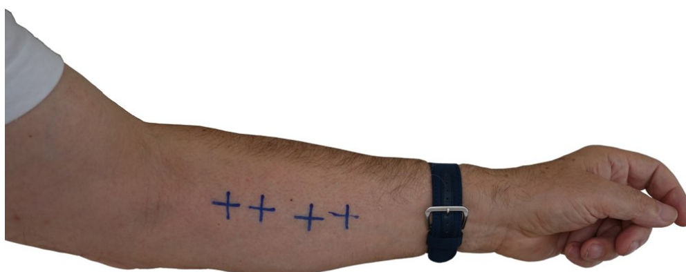
Figure 2: The four sites of the volar forearm measured with each instrument at each geographic location during the study.

At each geographic location, volar forearm TEWL measurements were performed on a single elderly subject with each instrument on the four sites of the volar forearm shown in Figure 2.