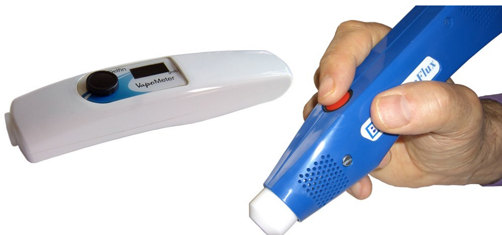
Figure 1: The two closed-chamber instruments used in the study. Left: Unventilated-chamber VapoMeter. Right: Condenser-chamber AquaFlux.

TEWL was measured using one unventilated-chamber VapoMeter (Delfin Technologies Ltd, Finland) and one condenser-chamber AquaFlux (Biox Systems Ltd, England).