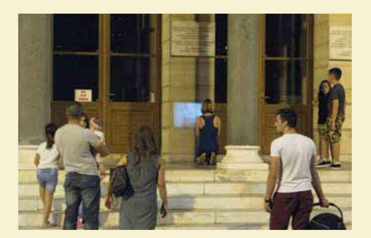
Vijécnica, Sarajevo Library, Sarajevo, Bosnia