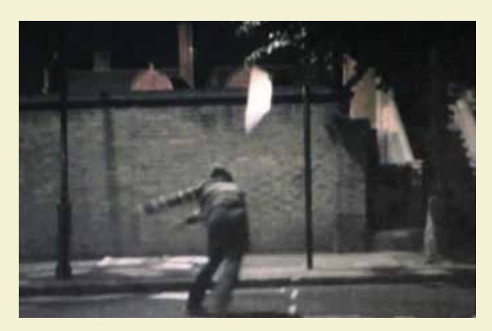
Give em Hell by Nada Prlja, 2008, Single screen video 4 min, DVD-Pal, colour, loop; Music: Ludwig van Beethoven, Symphony Nr. 9 d-moll, op. 125.