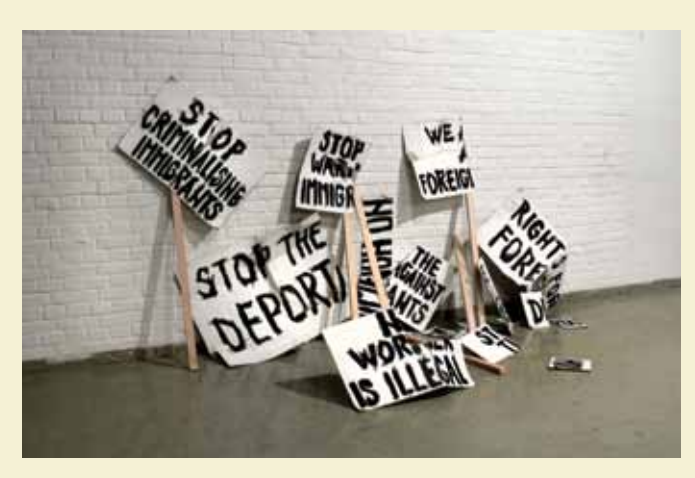
Stop the War Against Immigrants I by Nada Prlja, 2008 7 broken protest banners; acrylic white and black paint on board, wooden sticks.

Nada Prija , The video material used to create this documentary video is recorded by a hidden video camera. During the course of several days in the summer of 2008, the artist positioned protest banners with pro-immigration slogans on the streets of London and secretly recorded the unfolding scene with a camera from the opposite side of the street.