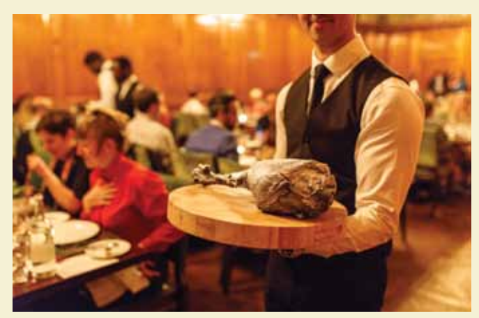
Pluto's Kitchen by Işıl Eğrikavuk, commissioned by Open Space Contemporary and Block Universe at the Ned, London, 2017.