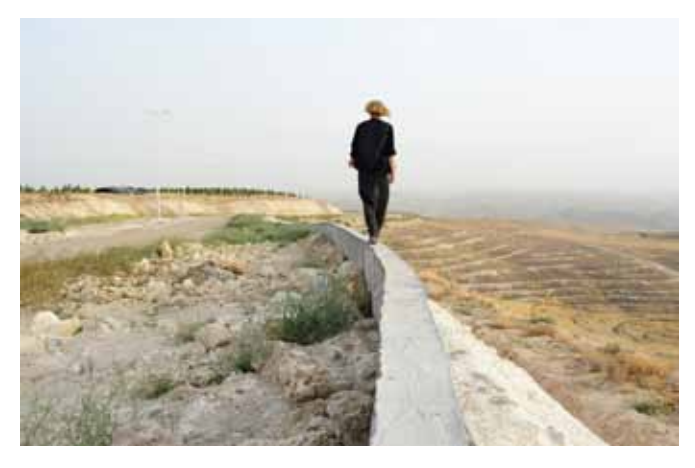
Mapping the Borders of a Turkish Institution, Performance Walk for Camera, Batman, 2014