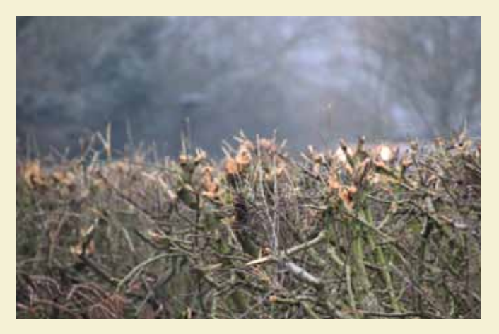
Mapping 1, 2016.