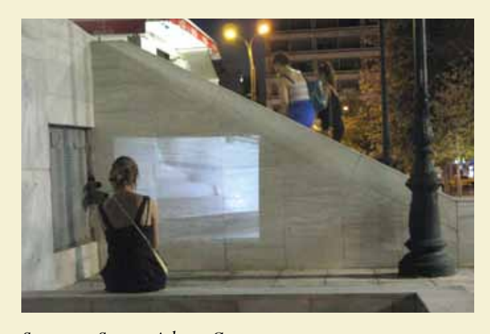
Syntagma Square, Athens, Greece

About the artist: Nicole Zaaroura is an artist working with photography, performance, sound, moving image and installation, to explore through documented performative acts, notions of intimacy and distance, the meditative and discordant, in both public and private locations. It is a practice rooted in encounter, and an investigation into the brutal tenderness within journeys.