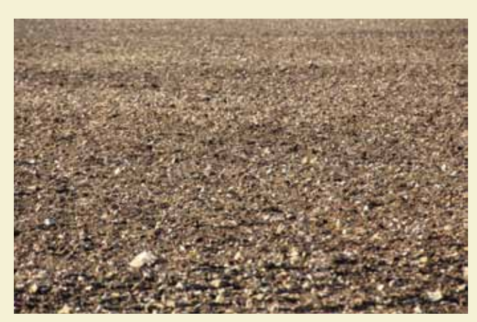
Mapping 2, 2016.