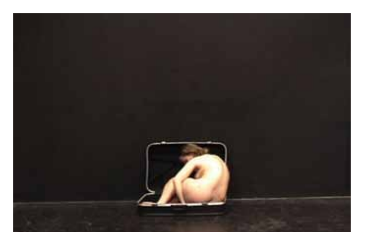
Elena Marchevska 'Insomnia' (2005) performance