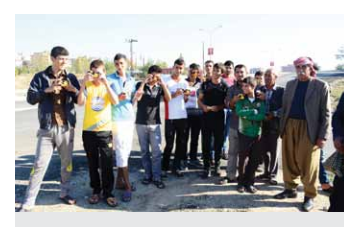
Waiting for a New Life, Photography project with Yezidi refugees using disposable cameras, Batman, 2015

wanted to take selfies with me, and then invited me to have lunch with them in their cabin. It's risky to be too open about political views there, especially if you have a position of authority, and so I think the playfulness of the action was quite appropriate, but I think that to do this as someone who actually is part of that community, or actually Kurdish would be perhaps more significant. After speaking with the professor who invited me and some of his friends, some said that they would have liked to join me on the walk or do something similar, would never ever be able to do that because of the possible repercussions. Actually, he is now under investigation after the military coup, as many academics in Turkey now are, but I have not heard from him for a while so I am not sure how he is.