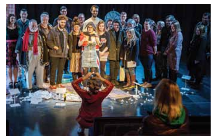
There There, Eastern European for Dummies, performance.

What kind of strategies are you using in order to address the current debates?