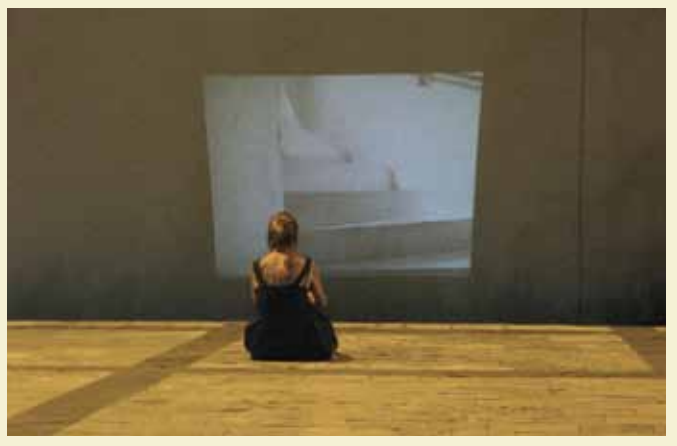
National Art Gallery, Tirana, Albania

Using a mobile phone projector sleeve kept in my purse, and kept close to my body, I projected a 4 minute looped film of a woman walking, itself a displaced 'pilgrimage'. 20 repeat presses, 20 small acts of memory disruption. The aesthetics of repetition and the pulse of the city.