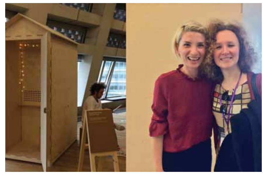
Waiting for a New Life, Photography project with Yezidi refugees using disposable cameras, Batman, 2015