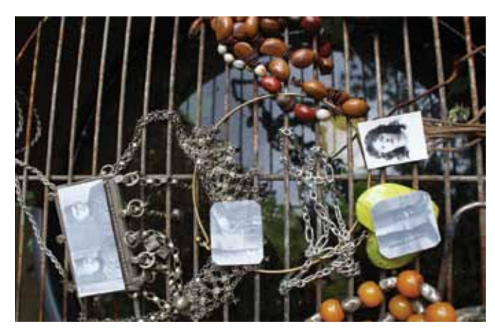
50 Rooms

experiencing anew personal states of imbalance and displacement, an audience member, who may or may not have experienced such a condition themselves, can approximate the pain of the other'. But in your work you go a bit further with this conceptual invitation, you open up a hospitable space by inviting interested nonperformers/audience to join your show and 'share autobiography'. What is 'shared autobiography'?