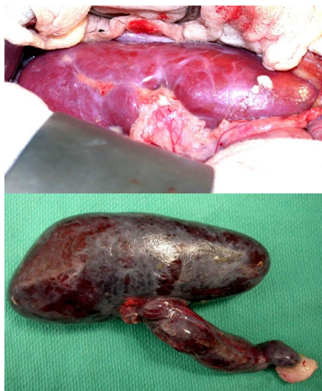
FIGURE 1 Top: A wild-type (genetically-unmodified) pig kidney immediately after its transplantation into a non-human primate recipient. It is a healthy pink color, indicating excellent blood flow. Bottom: The same kidney 5 min later. Immediate (hyperacute) rejection has taken place, consisting of thrombosis in the blood vessels, rupture of blood vessels, with hemorrhage into the tissues of the kidney, rendering it black

Following the development of gene-editing technology, it became possible to modify the pig genome by inserting or deleting genes