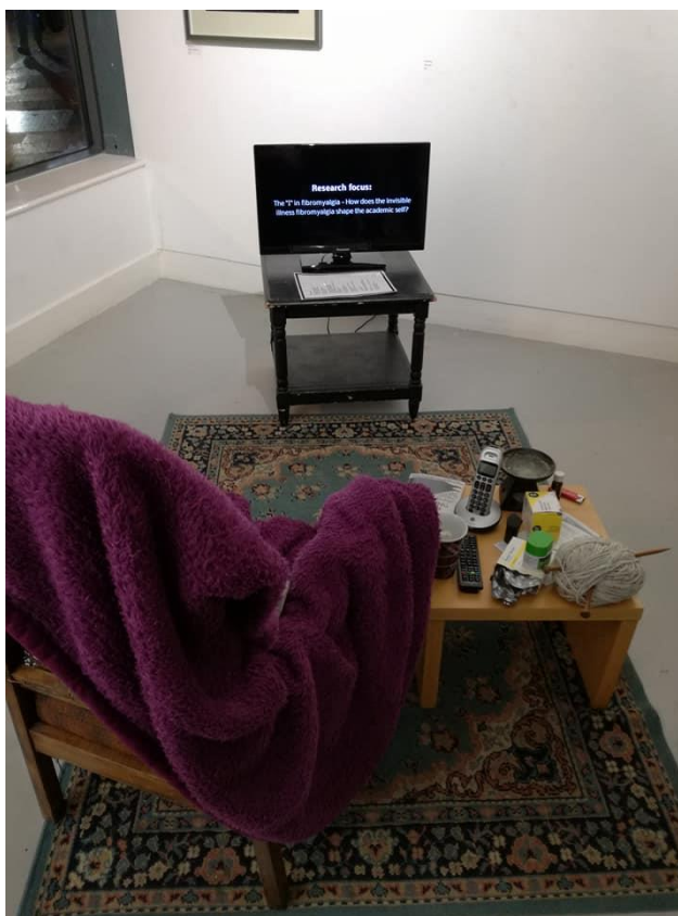
Figure: Installation – Peace Treaty

Once the installation was completed, I realized that the boundaries between my own experiences and those of the participants had become blurred in the Deleuzoguattarian interpretation of fluidity and movement. And yet, this process still allowed me to consider all elements as "quasi-objective" (Foley, 2002, p. 473).