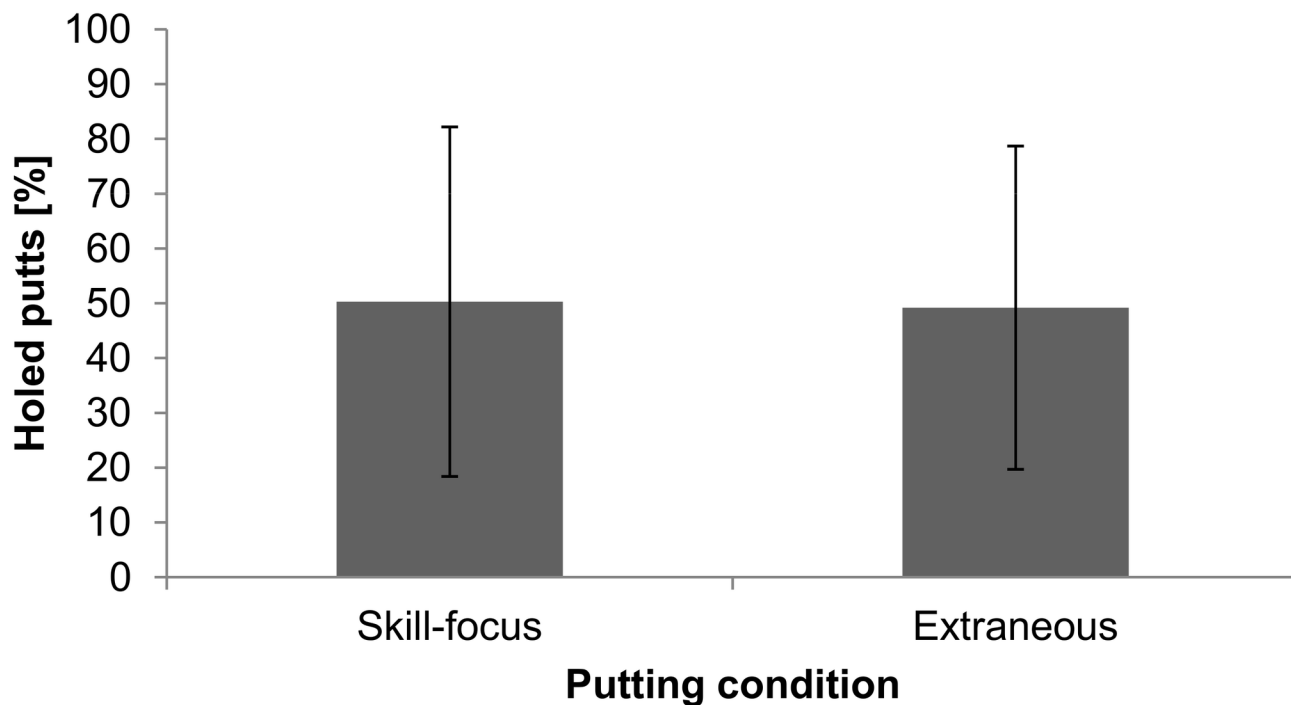
Figure 3. Performance in the skill-focus ( SE = 7.3 ) and extraneous ( SE = 6.8 ) conditions. Error bars indicate the standard deviations of the mean.