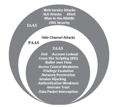
Fig. 1. Types of security attacks in cloud on the basis of deployment model.

In Fig. 1, intrusions have been identified and classified on the basis of deployment model (SaaS, PaaS and IaaS).