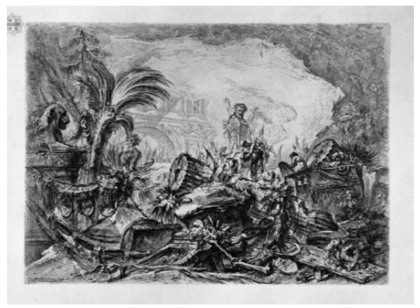
Figure 3. Giovanni Battista Piranesi, Capricci or Grotteschi, 1744–47; Opere Varie, 1750, second edition.

Already invaded, contaminated and occupied by other bodies, this is what remains of ancient architectures. The ensembles of Piranesi's Capricci , congested with vestiges of the past and heterogeneous records of their inevitable transformation, prepare the ground for a freedom of architectural and spatial experimentation.<sup>11</sup> Rather than the documentation of the ruins of the past, here we have the reinvention of a fantastic antiquity through the reuse of its fragments. Rather than the fragment as a trace of the past, here we have the present of the fragment and the fragment in the present, amnesiac and available in real time, so that '[w]e can only see these things as they are' (Argan), and their representation – combining of necessity documentation and imagination, performs a re-signification.