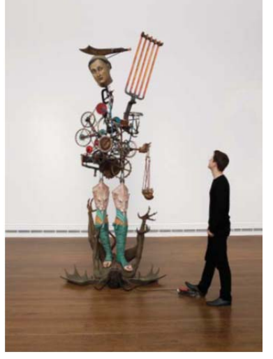
Figure 7. Michael Landy, Saints Alive. Multi-Saint, 2013 (source: the Artist; courtesy of the Artist and Thomas Dane Gallery, London).

The result of Landy's work on the paintings of the saint martyrs continues some of the themes of his previous works: the catalogue and the destruction, the ephemeral and the violent. For the National Gallery he produced a series of larger than life Tinguely-esque interactive kinetic sculptures that combine fragments of the saints and their attributes drawn from many different paintings in the collection.<sup>24</sup> These machines perpetuate with their repetitive motion the moment of violence, torture or attack that has elevated the victim to sanctity: Apollonia plucks her eyes; Thomas points his finger at Christ's chest so violently that his headless torso swings like a punching ball; Catherine's gigantic wheel can be spun by gallery visitors; Francis dispenses t-shirts like an amusement park's 'fish-the-plush-toy' attraction; Jerome beats his chest with a stone to self-destruction, in order to keep at bay his impure thoughts.<sup>25</sup> Most interesting of them all is Multi-Saint (2013), a hybrid construction made of a pair of Satan-