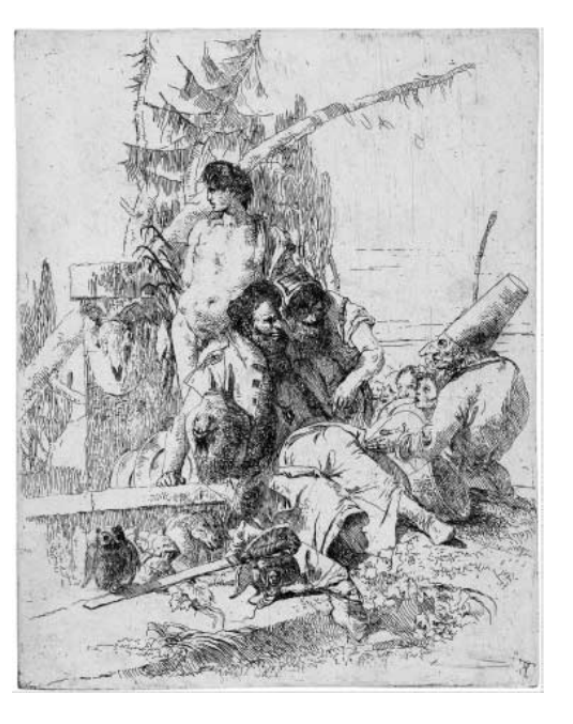
Figure 2. Giovanni Battista Tiepolo, 'Pulcinella gives counsel'. Scherzi di Fantasia, c. 1743-57. (source: Art Gallery of South Australia: Wikmedia commons http://commons. wikimedia.org/wiki/File: Giambattista_ Tiepolo_-_Punchinello_ gives_counsel_-_from_ the series % 27Scherzi_di_Fantasia %27_-_Google_Art_ Project.jpg, accessed 02/02/11).

Both timeless and simultaneous<sup>7</sup> these beings and objects do not allow chronological unfoldings: there is no linear narrative here, but a circular recombination that refuses a resolution. Like the rest, the remnants of ancient sacred architectures included in these jumbles are dissolved and re-combinable – available to enact a new (or another) kind of proximity, in a space that blurs the distinction of form and matter. The vast brightness of these images – that excess of light that blinds any understanding – surrounds the groups of the Scherzi , ephemeral clumps of matter, gathered in an unlimited space that they cannot control. That which cannot be seen in the blinding light (death? divinity? the infinite? an incomprehensible idea of space?) is that which is not