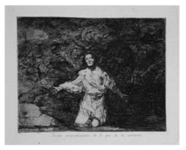
Figure 6. Francisco Goya, Los Desatres de la Guerra, Plate 1, 'Dire Forebodings of What is to Come', 1810-20.

Starting from Goya's prints, the Chapmans' works take on their own life, and a further series of references. From the marking and the effacement of given images – like the graffiti of a swastika sign on Goya's Plate 39, 'What a Feat! With Dead Men!' – to their reworking of other Disasters with additions that the Chapmans call 'improvements', to the construction of sculptural compositions that reproduce Goya's images ( Great Deeds Against the Dead , 1994) or reinterpret them in scenes of nauseating decomposition ( Sex I , 2003), in different ways the Chapmans take Goya's works out of the timeless and universal realm of art, and reactivate them (in this sense they are 'improvements'), not only by bringing selected elements and faces (and therefore identities) to the fore of the images and to the