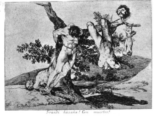
Figure 5. Francisco Goya, Los Desatres de la Guerra, Plate 39, 'Great deeds! Against the dead!', 1810–20 (source: Arno Schmidt Reference Library; Wikmedia commons http://commons. wikimedia.org/wiki/File: Goya-Guerra_(39).jpg, accessed 02/02/11).

etched line to obliterate time and space. Goya's aquatint creates fields of textures that layer in flattened depth around and through the groups of bodies, and 'the drama and intensity of the scenes become perfectly integrated with the expressive possibilities of his technical means.'<sup>19</sup> Space here is only in the action of the bodies; the rest of the image remains an opaque depthless field, apparently even and neutral, but in fact concealing further disasters. Each of the episodes, disconnected from the others, becomes an absolute island of universal horror, threatened to disappear into the sameness of indifference.<sup>20</sup>