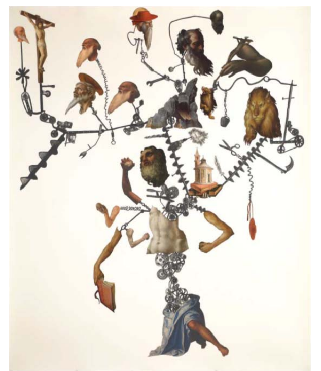
Figure 8. Michael Landy, Saints Alive. Penitence Machine (Saint Jerome), 2012 (source: the Artist; courtesy of the Artist and Thomas Dane Gallery, London).

The key to an understanding of these torture-iterating machines lies in their preparatory work: the drawings of the parts, the cut up pieces of the paintings' images, and their collages, which are in turn redrawn in a self-feeding process. More than a documentation of the working process, these drawings and collages are the long lasting pieces of this composite work. In them Landy studies and redraws a selection of paintings from the National Gallery collection, choosing as he redraws the key elements of each painting, and of each saint in each painting. At first architectural and natural backgrounds are removed, as well as the ground, and the characters float in the black ink of the drawing, as if on a contemporary theatre stage. Liberated from all