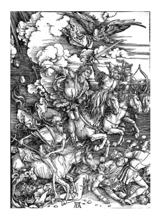
Figure 1. Albrecht Dürer, The Revelation of St John: The Four Riders of the Apocalypse, 1497–98. (source: Staatliche Kunsthalle, Karlsruhe; Wikmedia commons - http:// commons.wikimedia. org/wiki/Image:Durer_ Revelation_Four_Riders. jpg, accessed 02/02/11).

At the level of the single image, Dürer condenses the biblical narration of John's Apocalypse in a synoptic narrative. For