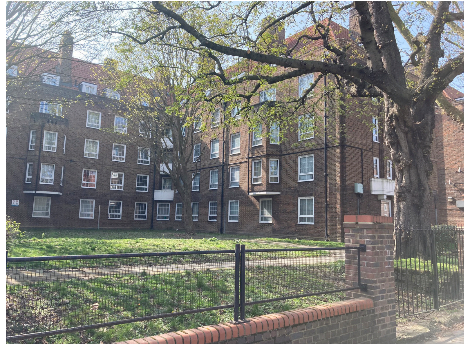
Left: Becontree, Dagenham, Right: Glebe Estate, Camberwell