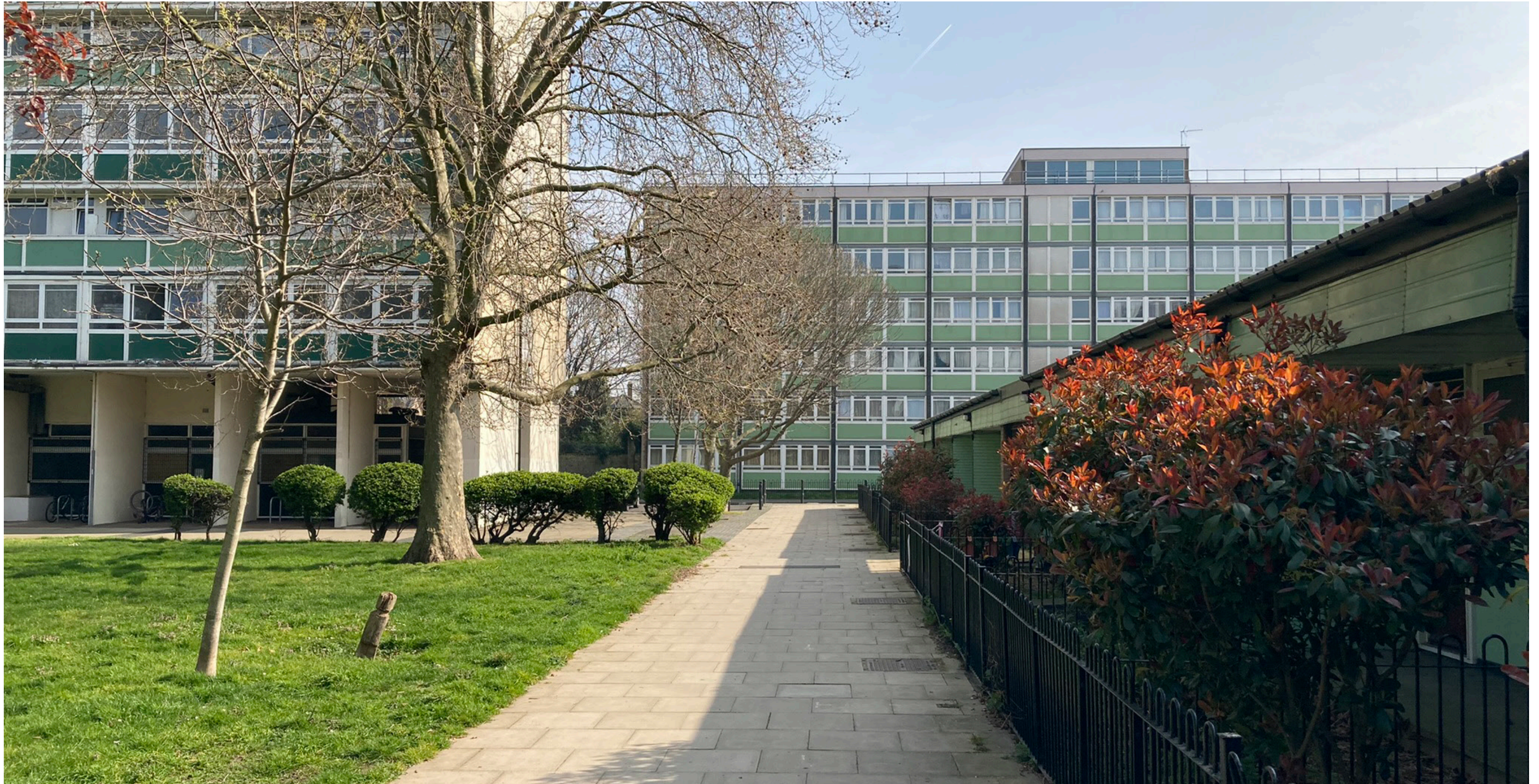
Sceaux Gardens estate blocks