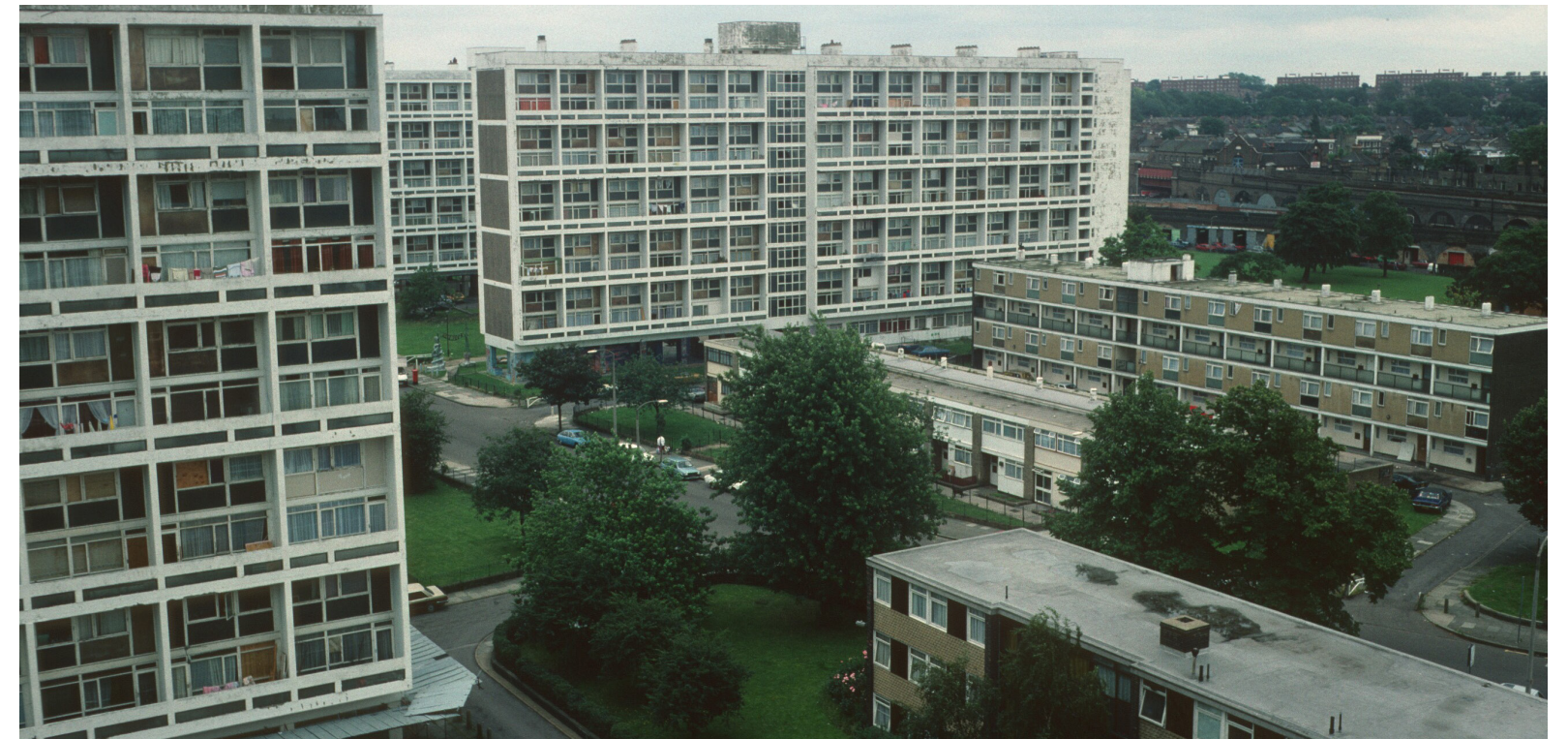
Left: Alton West Estate, Wandsworth; Top right: Bentham Road Estate, Hackney; Bottom right: Loughborough Road Estate, Lambeth