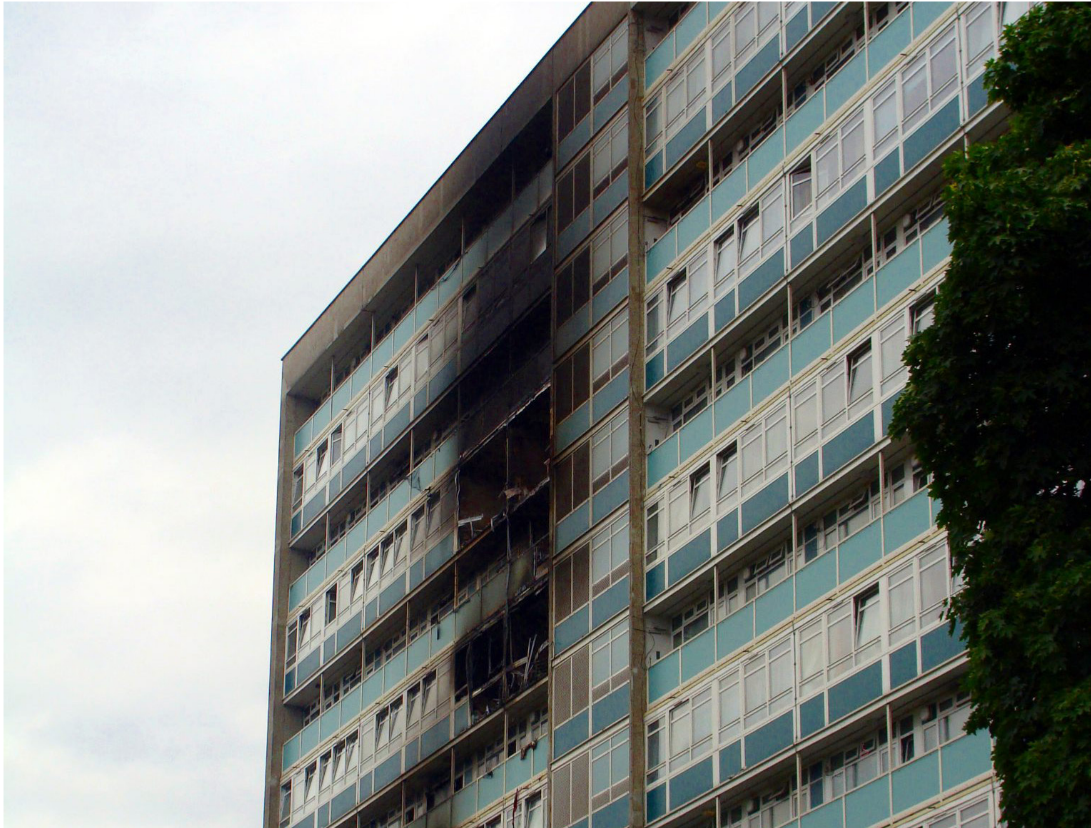
Lakanal House Fire, 2009