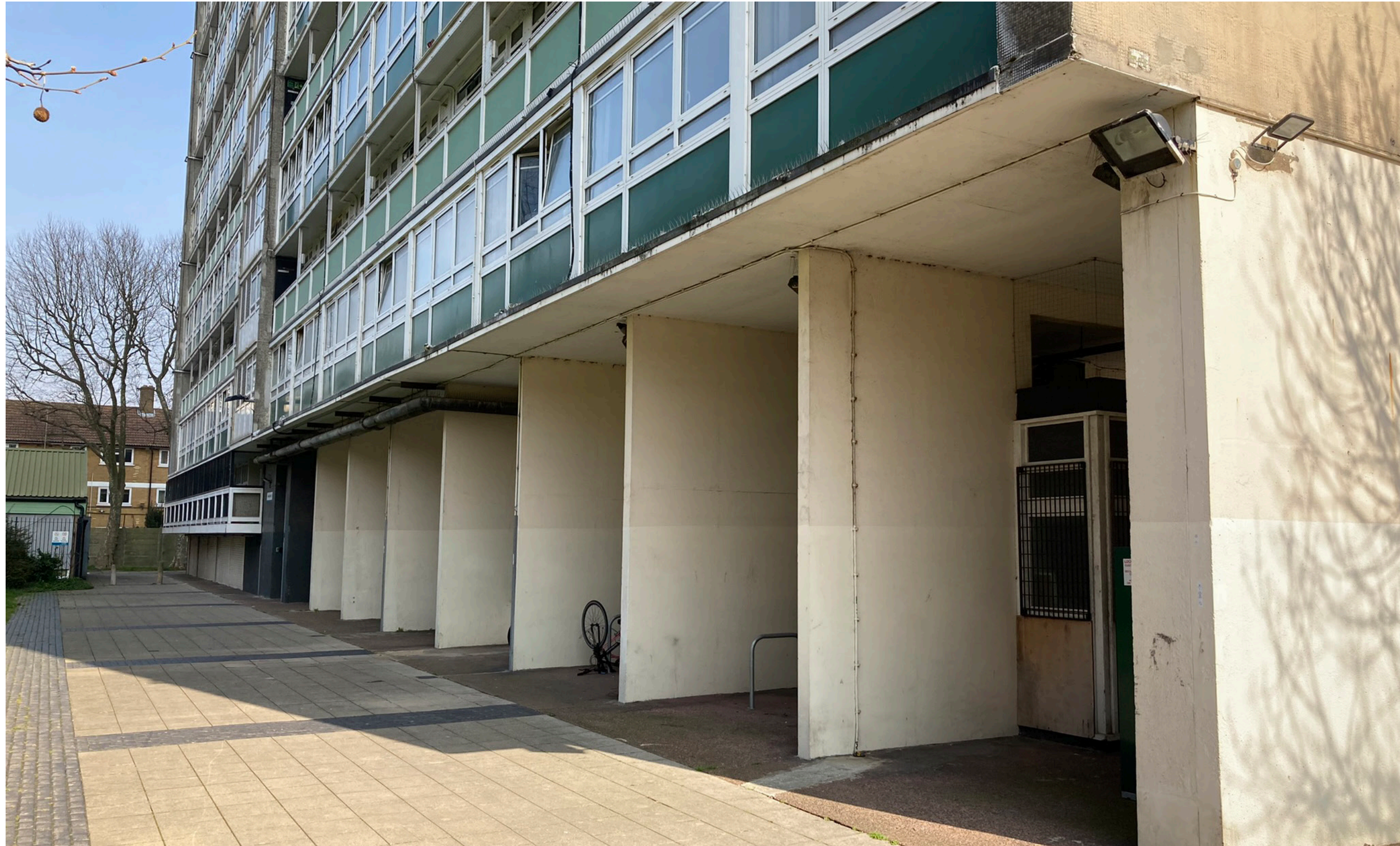
Ground floor, Marie Curie House