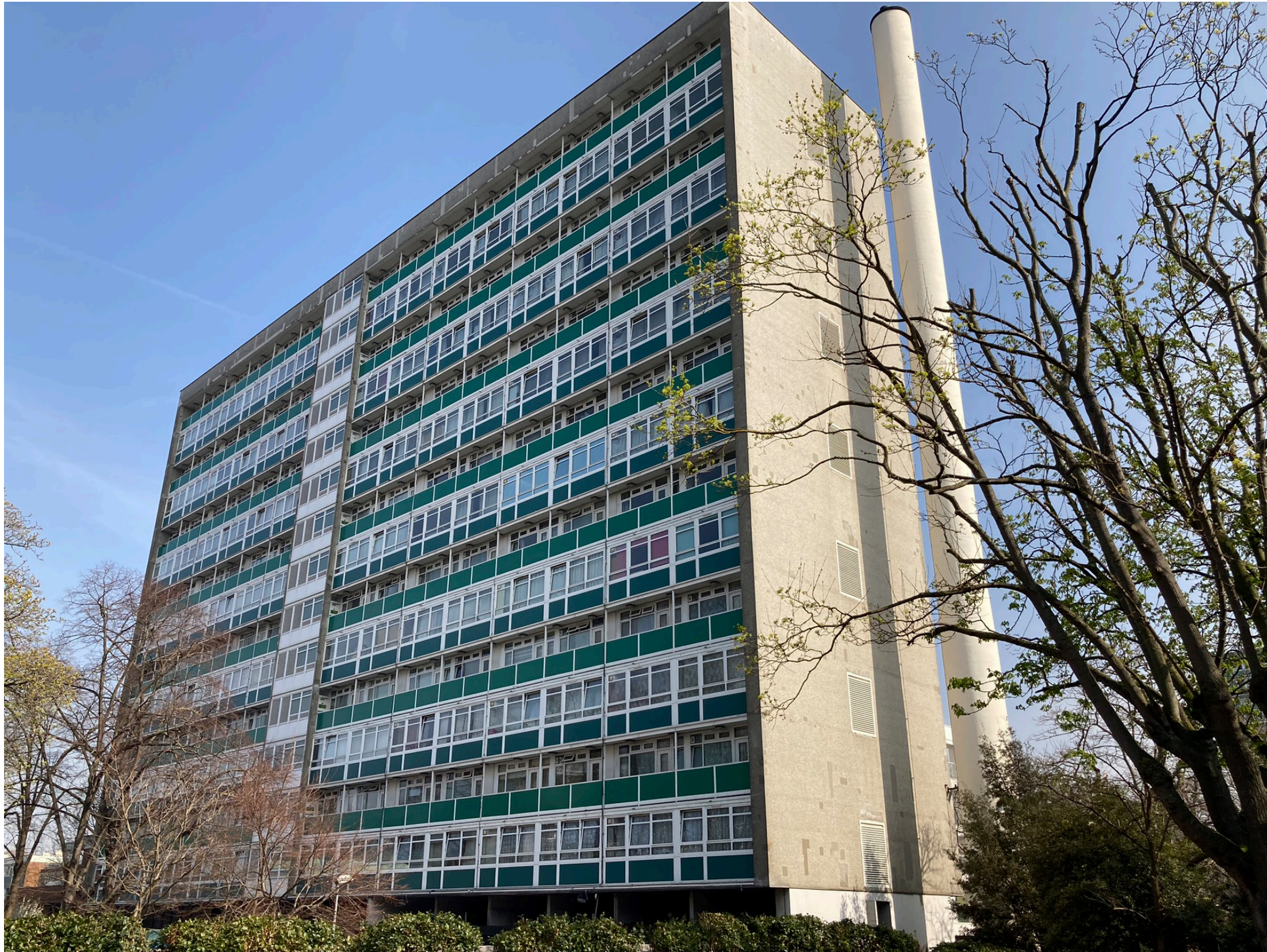
15-storey Lakanal Block