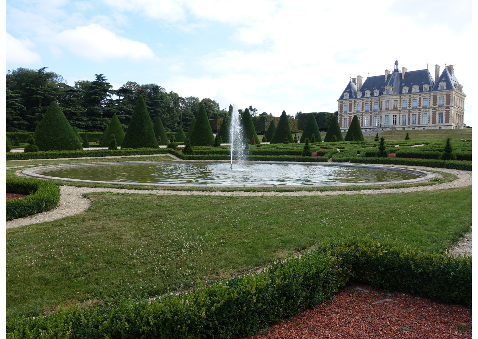
Left: Ville de Sceaux ('Ville de Sceaux', 1954), Right: Parc de Sceaux