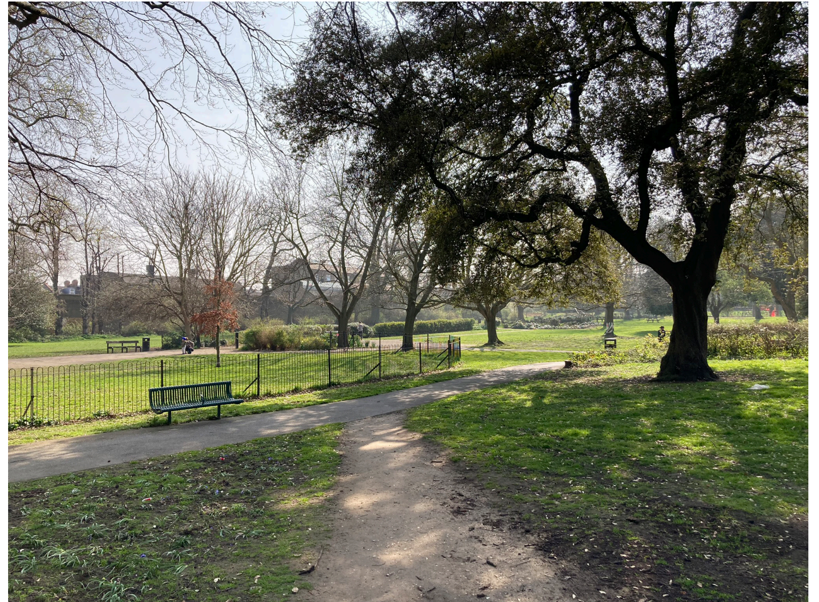
Left: Southwark Council Registry Offices, Right: Lucas Gardens