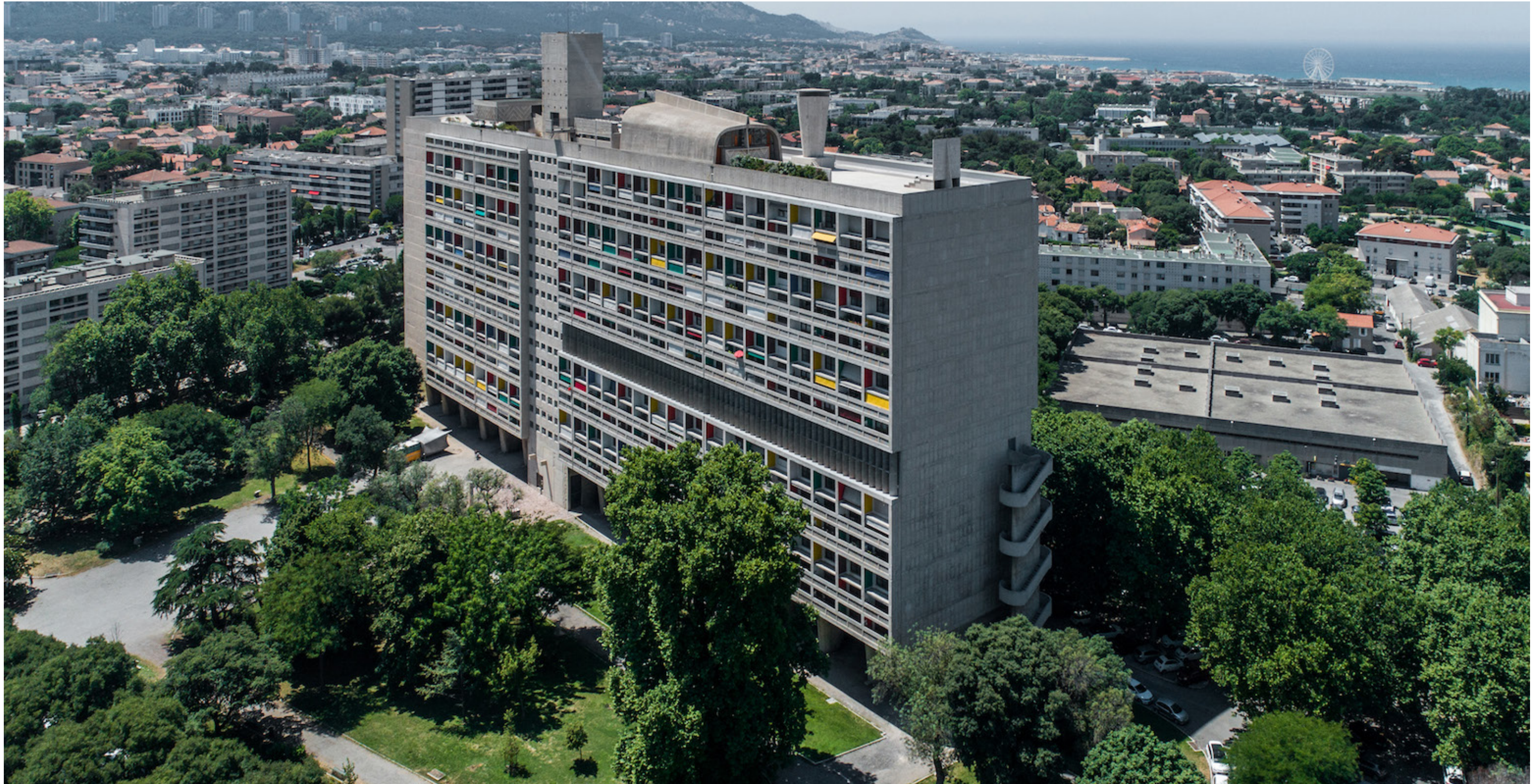
Unité d'Habitation, Marseille by Le Corbusier