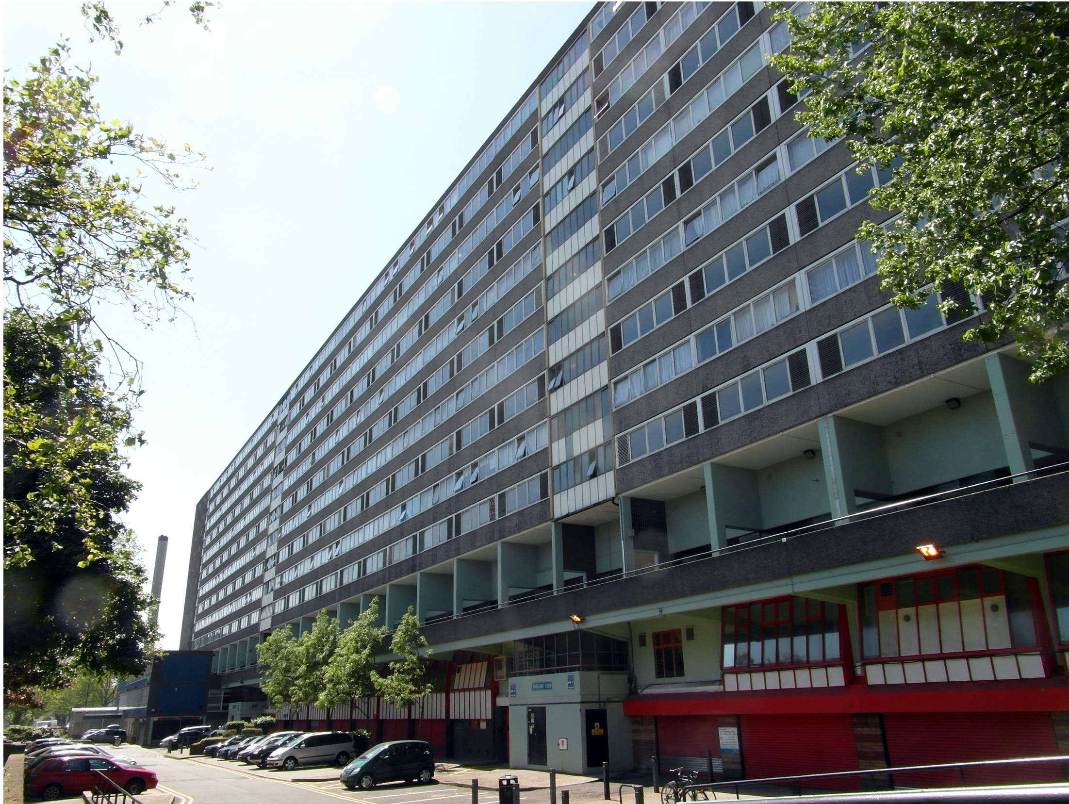
The Aylesbury Estate, built 1967-77