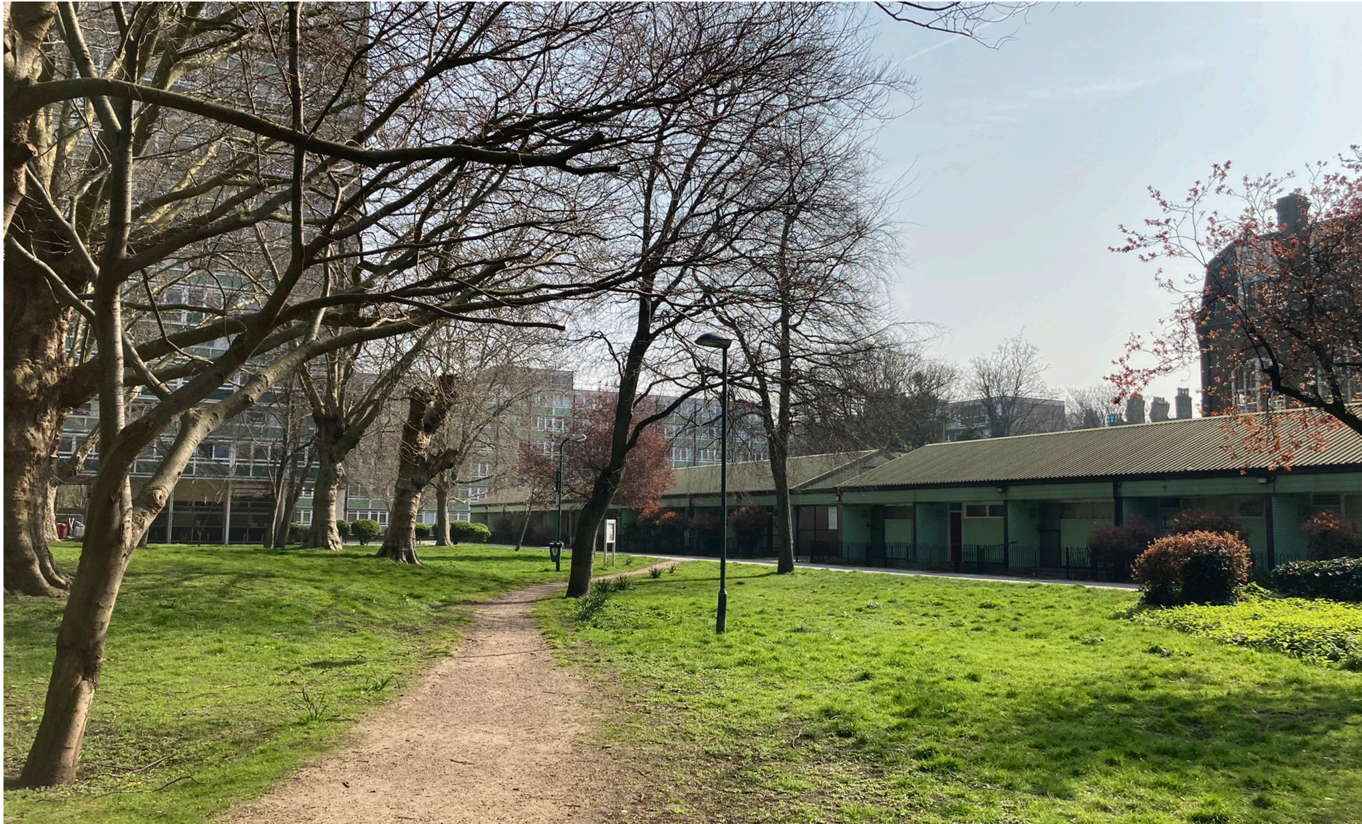
Sceaux Gardens Estate