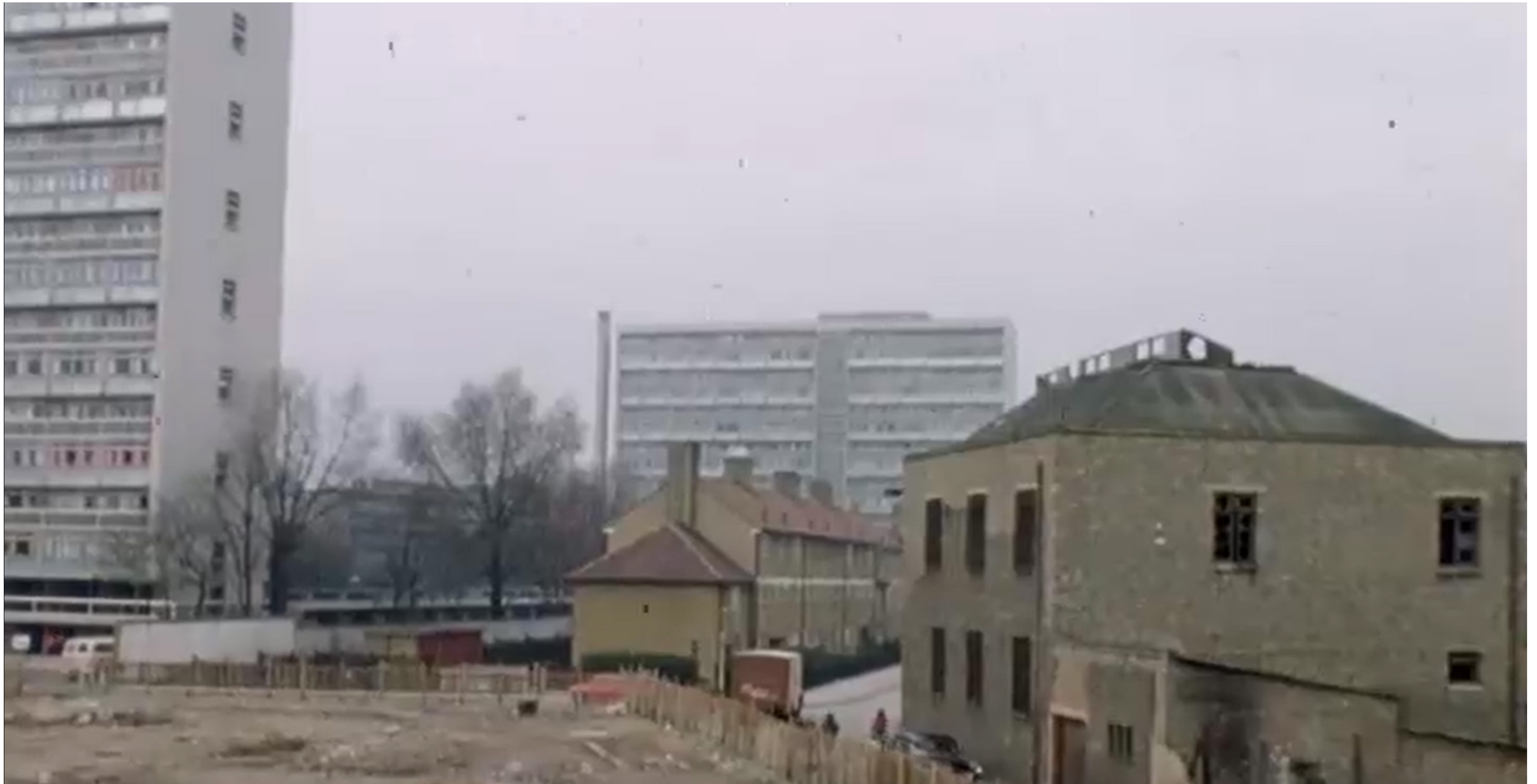
Sceaux Gardens behind construction work (The Changing Face of Camberwell, 1963)