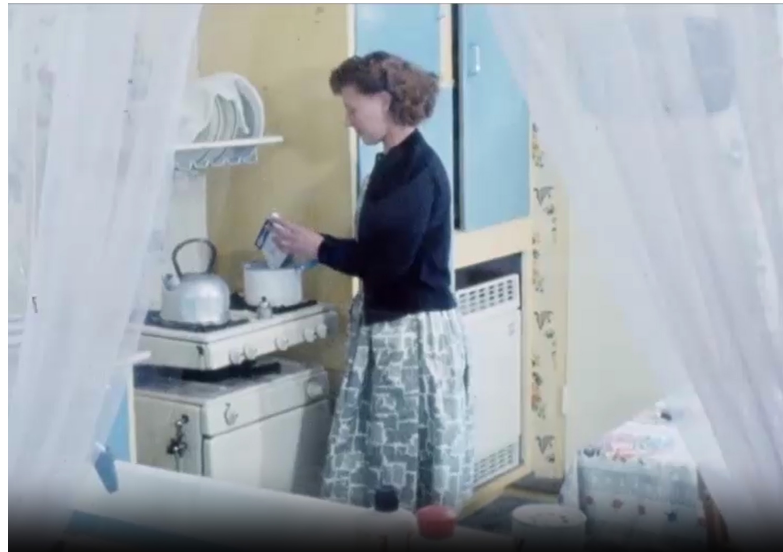
Left: Waterloo Square interior, Right: Lakanal House interior (The Changing Face of Camberwell, 1963)