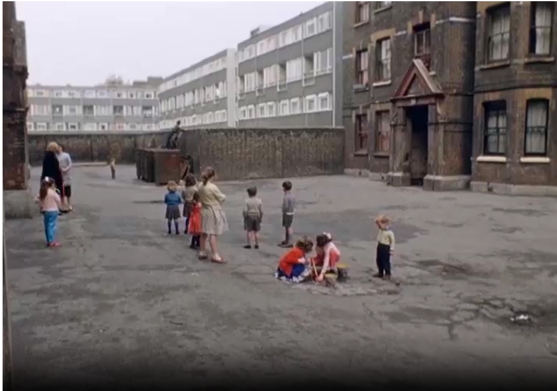
Waterloo Square (The Changing Face of Camberwell, 1963)