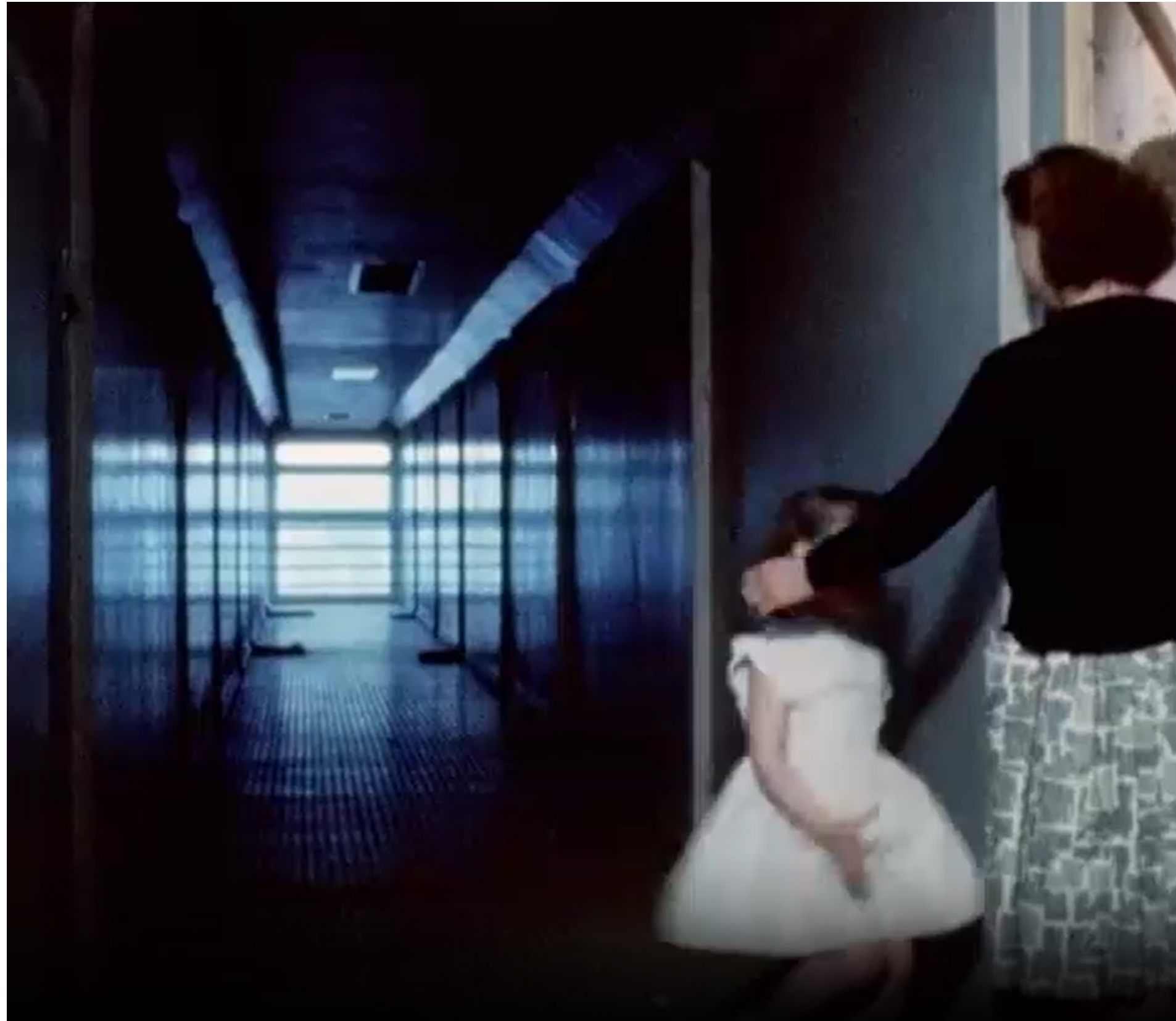
Internal corridor, Lakanal House (The Changing Face of Camberwell, 1963)