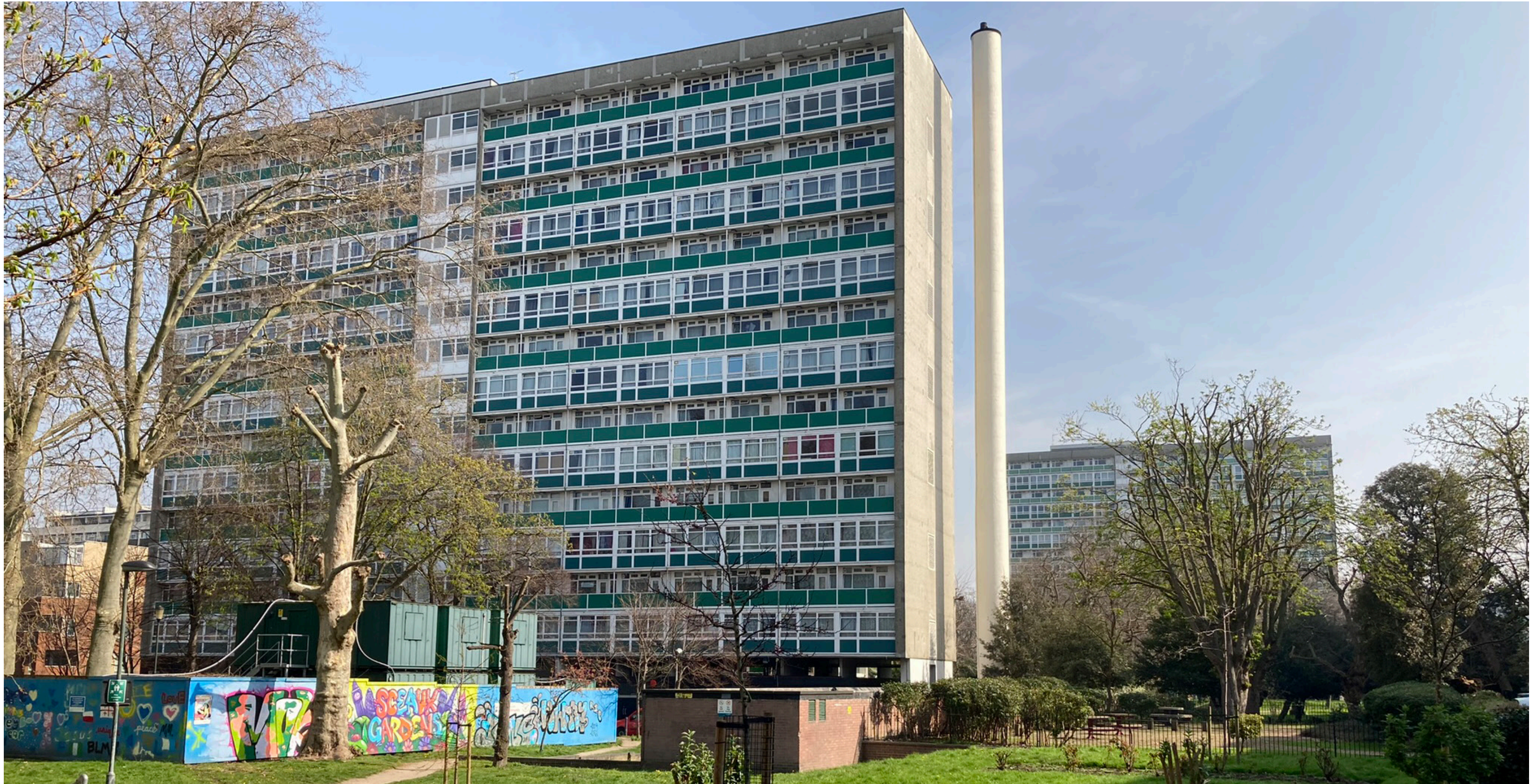
Sceaux Gardens Estate, Camberwell