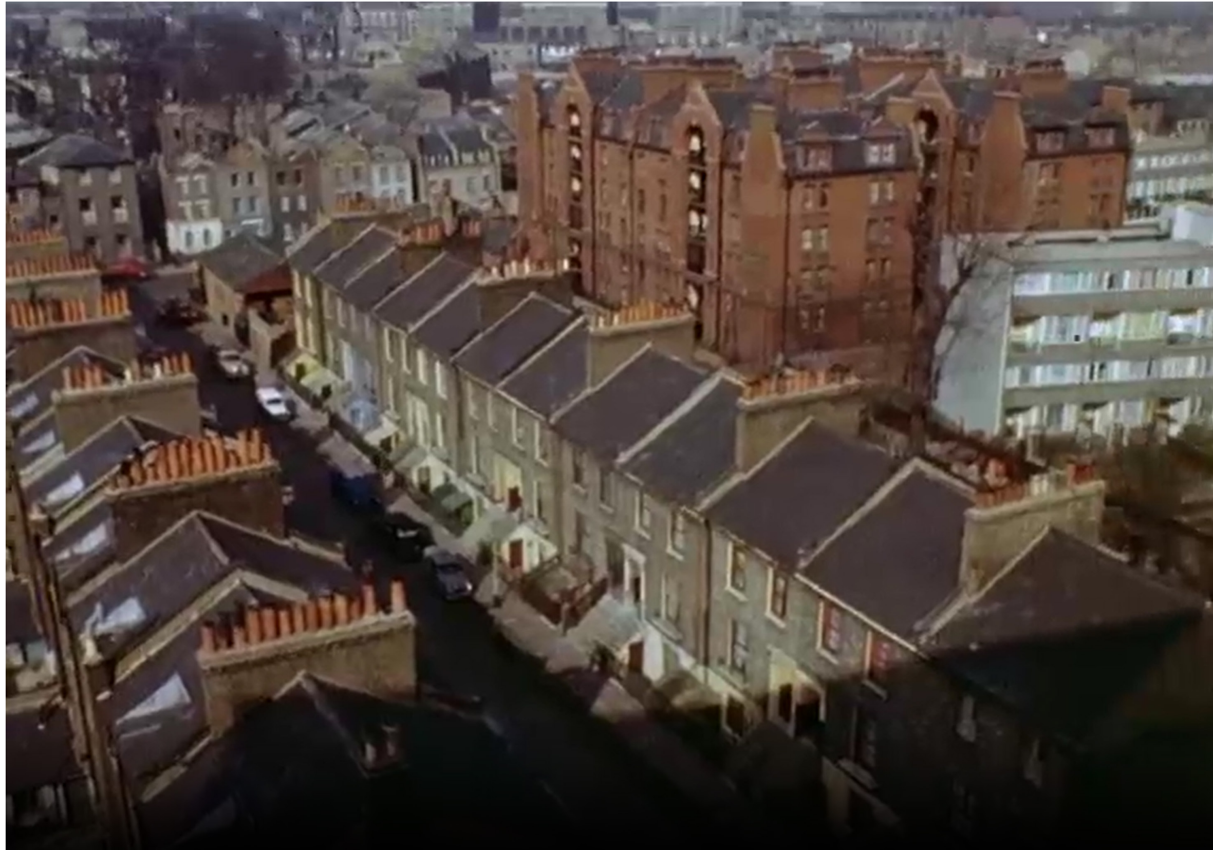
Homes in Camberwell (The Changing Face of Camberwell, 1963)