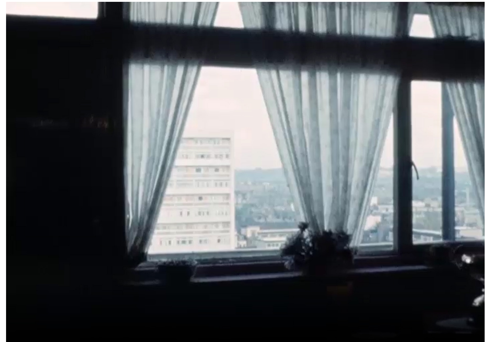
Left: View from Lugard Road terraced home; Right: View from window of Lakanal flat (The Changing Face of Camberwell, 1963)