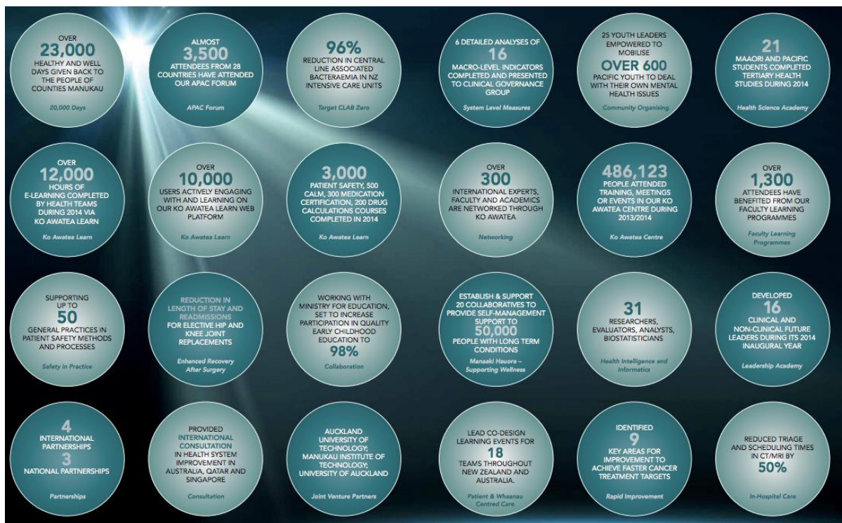
Fig 3 from We are Ko Awatea 2014 p6