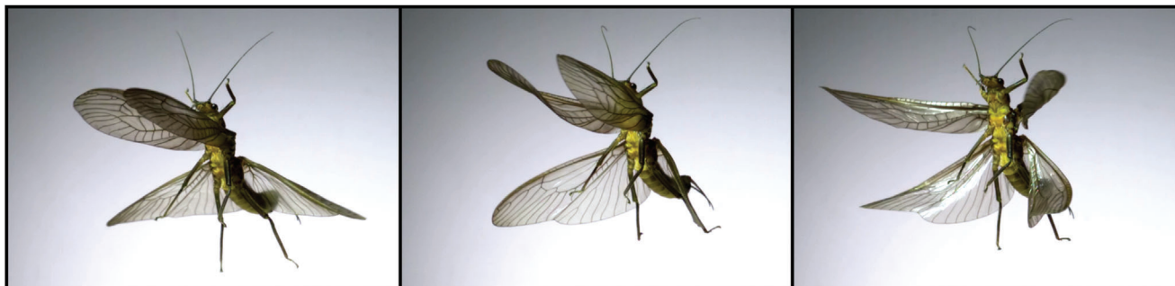
Figure 1. Automatic shape morphing of wings of a stonefly (Plecoptera) during takeoff. Wings undergo significant deformations that are controlled by the wing design.

yet highly controlled passive deformations in flight [11] ( Figure 1 ). The adaptability of insect wings is automatic and merely determined by their design architecture. Although wings consist of multiple components that contribute to their adaptability to flight forces, “vein micro-joints” play a key role in this regard. [12–15] Vein micro-joints, distributed all over the wings, are compliant joints, formed by the intersection of two or more reinforcing elements, known as veins. In general, they consist of crossing elements and spikes that work as stoppers, which limit deformations and stiffen the wings. The elaborate design of vein joints determines how wings respond to flight forces both locally and globally.