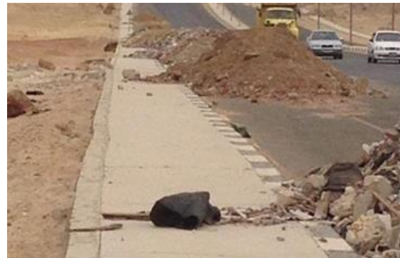
Figure 1. Construction Materials Waste Dumped on an Egyptian Public Road [4]

Recently, Egypt, in an attempt to improve the current environmental conditions, has introduced the Egypt's SDS 2030. The environment is one of the main pillars of the SDS in Egypt. The strategic vision of Egypt's SDS 2030 clearly states that "environment is integrated in all economic sectors to preserve natural resources and support their efficient use and investment, while ensuring the next generations' rights. A clean, safe and healthy environment is leading to diversified production, resources, and economic activities,