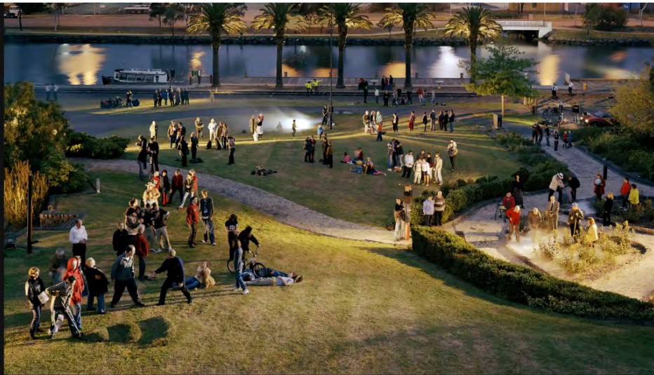
Crowd Theory: Braybrook, 2004