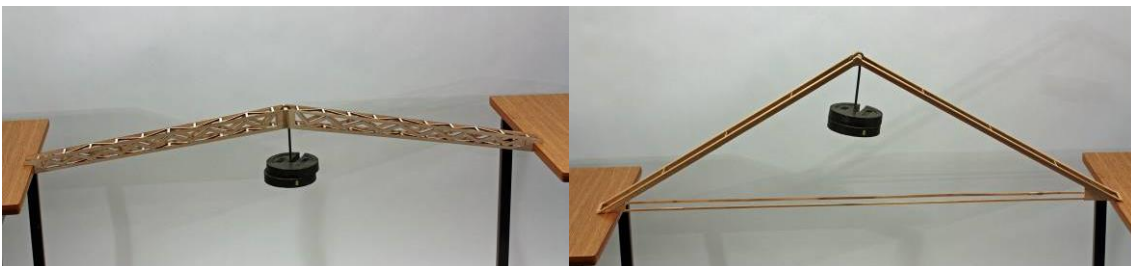
Figure 2: Compression structures using the tables or tension members to take side load

If the bridge idea is forgotten, the next concept that works is a compression structure. This has two or three variations: the first is to use the corners of the tables to take side loading, and the second is to use ties across the bottom. Figure 2 demonstrates this approach.