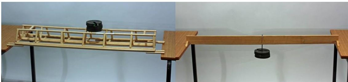
Figure 1: Beam concepts – heavy and light versions

The obvious design concept is a beam. These can be commendably light: below 20 grams is possible. Some students decide that 914mm width takes the load and forget about integrating the ends. Figure 1 shows two beam structures – the left one shows this and also what happens when the weight criterion is ignored, perhaps in the knowledge that any successful structure passes.