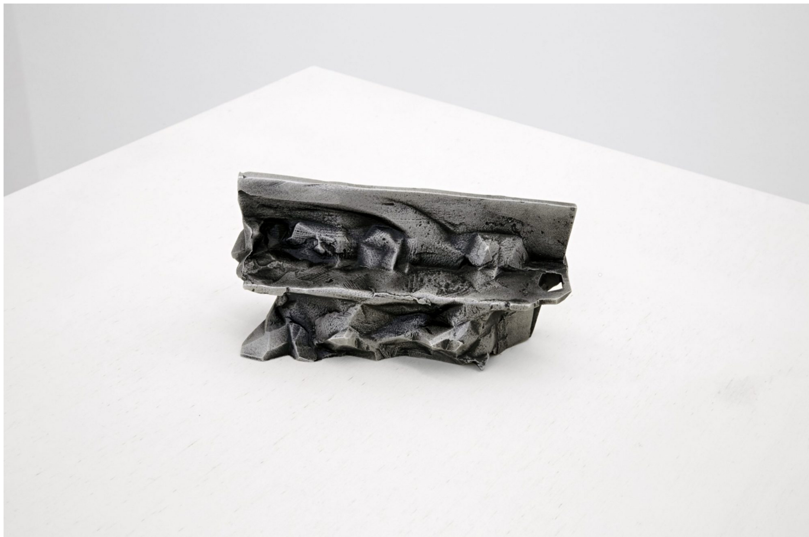
Simon Terrill Plato's bench , 2018 Cast aluminium 5.5 x 12 x 3.5cm