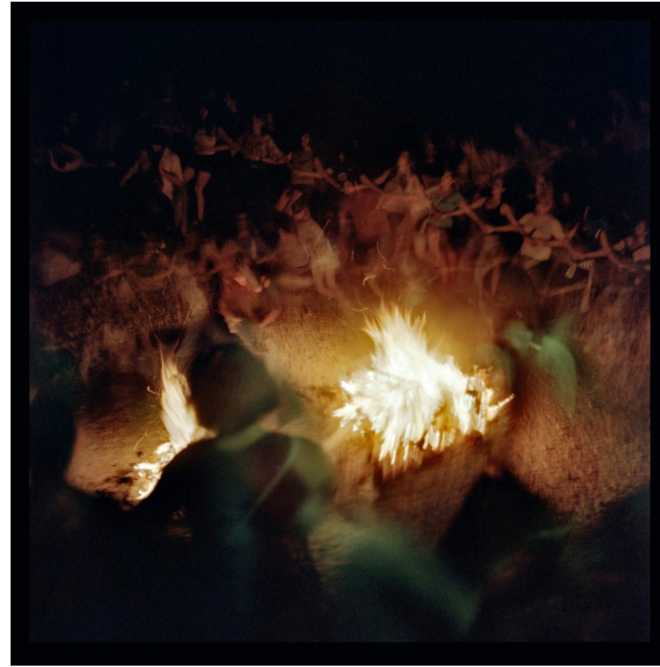
Simon Terrill Dark as my heart #3 , 2018 Type C print 69.5 x 70cm ed. of 6 + 2AP