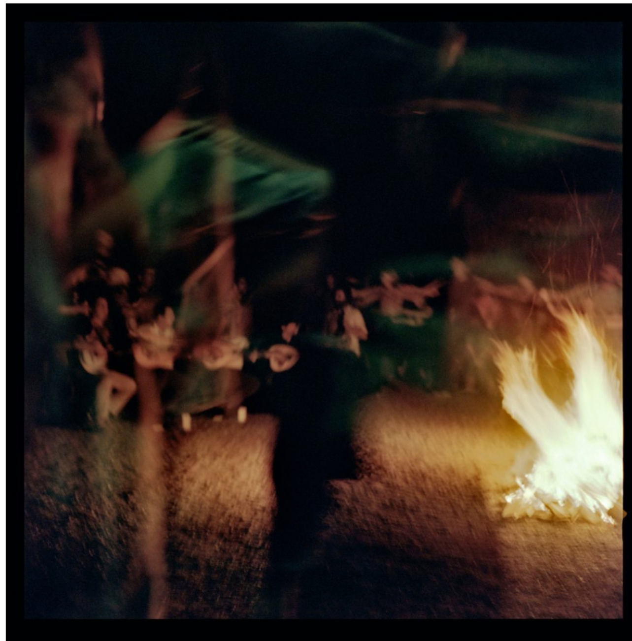
Simon Terrill Dark as my heart #1 , 2018 Type C print 69.5 x 70cm ed. of 6 + 2AP