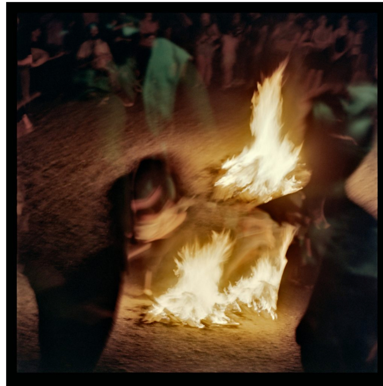
Simon Terrill Dark as my heart #2 , 2018 Type C print 69.5 x 70cm ed. of 6 + 2AP