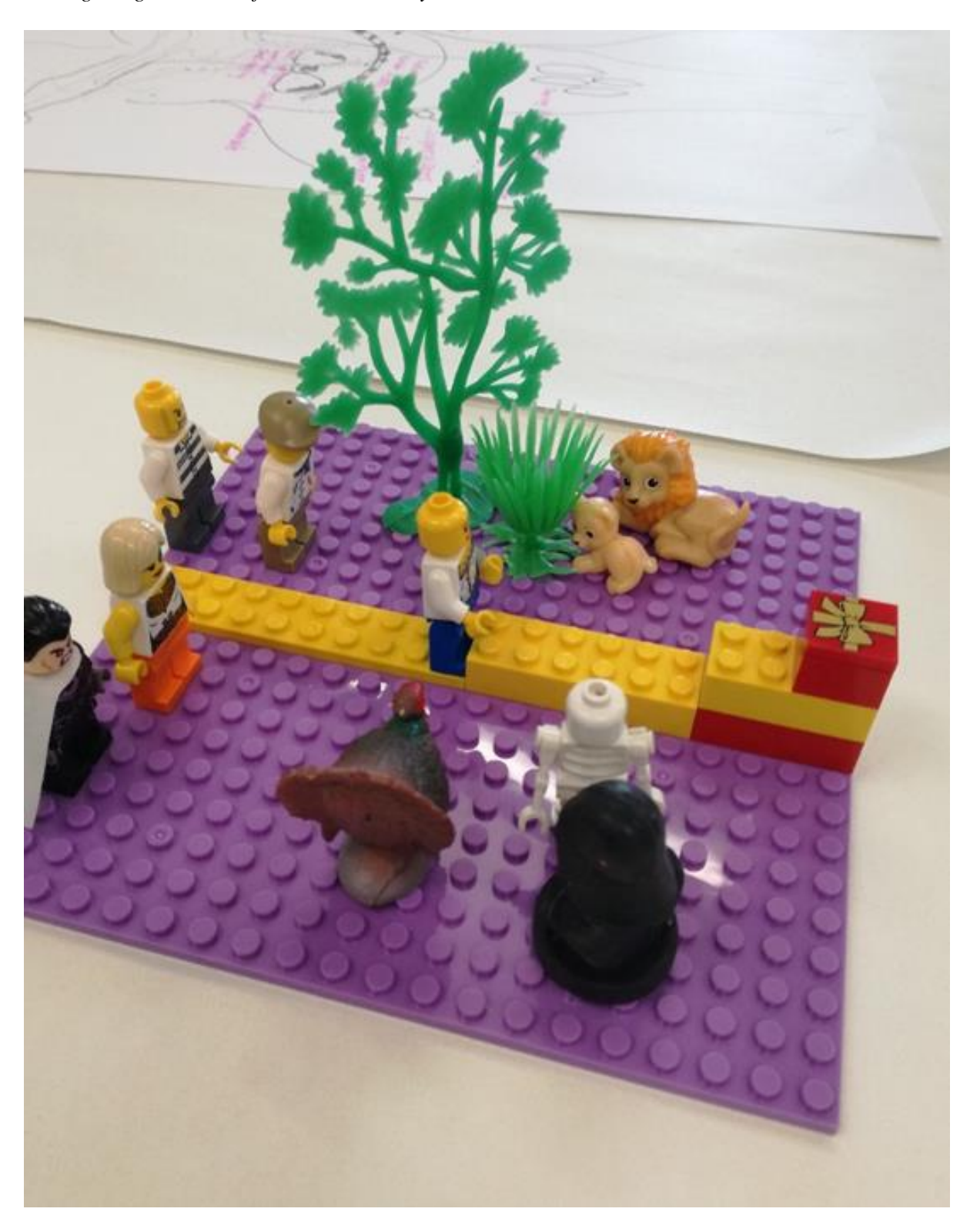
Figure 5 Phueng's Lego® Model of the Ph.D. Journey