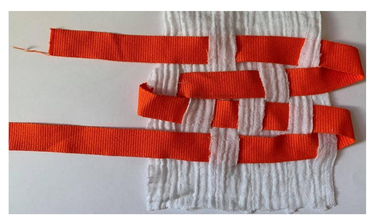
Figure 12: Visual Representation of a Less Robust Systematic Visuo-Textual Analysis, Due to Skipping Steps

As a consequence of this constant and consistent revisiting of data, the Systematic Visuo-Textual Analysis is certainly not for the faint-hearted, as it is a labour-intensive process. The danger with this framework therefore lies in the attempt to skip elements or levels to reduce the burden on the researcher. We argue that missing steps is indeed possible and would still make the analysis systematic but would reduce the quality of the analysis. This is probably best exemplified in the juxtaposition of a less robust weave (see Figure 12) against the original weave image (see Figure 4 above):