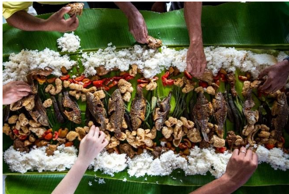
Fig. 5. This image depicts Kamayan or kinamot, the traditional Filipino method of eating, where food is served on banana leaves and eaten without utensils

Local knowledge refers to the contextual knowledges of the people about themselves and their situations. Often times, they know more about the problem(s) than experts. Thus, by taking into account practices that exist at local/regional levels, this pattern could serve as a model for transition towards a sustainable circular economy.