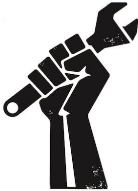
Fig. 3. Detail of the iFixit Repair Manifesto, by iFixit.

Right to Repair, The Commons, Open Source Ecology, Local Knowledge, Degrowth, Enoughness, Permacomputing, Environmental Impact Mediation.