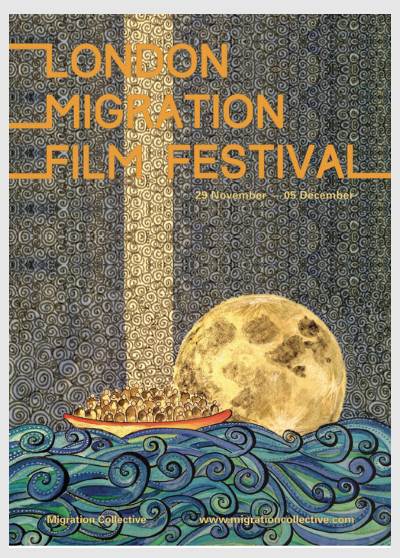
Special screening: London Migration Film Festival