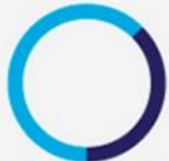
Mode of study