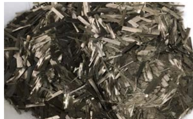
12.7-mm chopped fibres