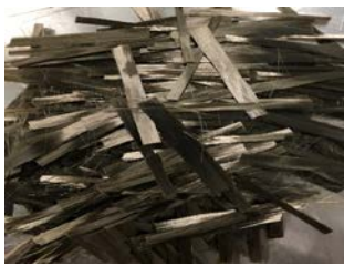
25.4-mm chopped fibres