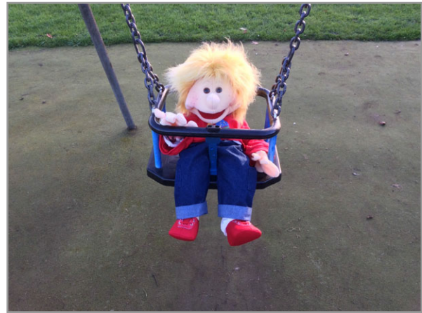
Fig 1. Billy the puppet.

To ensure faithful representation of child data we used three methods of holistic, selective and detailed analysis, 20 which involved viewing the data (interview transcripts, artefacts with child explanations and observer notes) as a whole, identifying