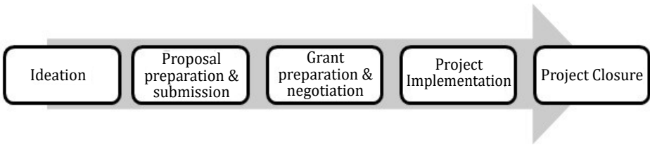
Figure 3. Phases of the grant lifecycle (Authors).

In a European academic context, PMOs can fulfil the three roles as identified in the PMBOK® (Table 2). Logically, a supportive PMO has the most confined role. This PMO type generally relates to the pre-submission, ideation stage of a grant - when a researcher is scoping the possibilities to submit a proposal and actual proposal submission is not yet certain. The main value-add for PMOs in this capacity is to act as an advisor or trainer, advising researchers aspiring to coordinate a project on grant requirements and the feasibility of the project idea. A supportive PMO often shares its experience without the ambition to partake in the actual project should it be retained for funding. In an academic context, the role of a supportive PMO might even be comparable to other academic support bodies such as research grant offices or technology transfer offices (TTOs) as it acts largely in an advisory capacity and retains relative proximity to the actual project or proposal. A supportive PMO might often work together with the aforementioned bodies to ensure an optimal relay of expert advice. Although a supportive PMO’s natural focus is the ideation phase, it can also assist during the other stages of the grant lifecycle.