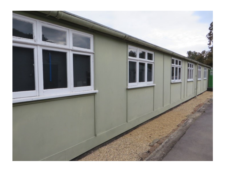
Fig. 3. Hut 6 at Bletchley Park, now restored.