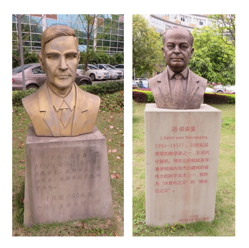
Fig. 6. Busts of Alan Turing (left) and John von Neumann (right) on the campus of Southwest University, Chongqing, China.