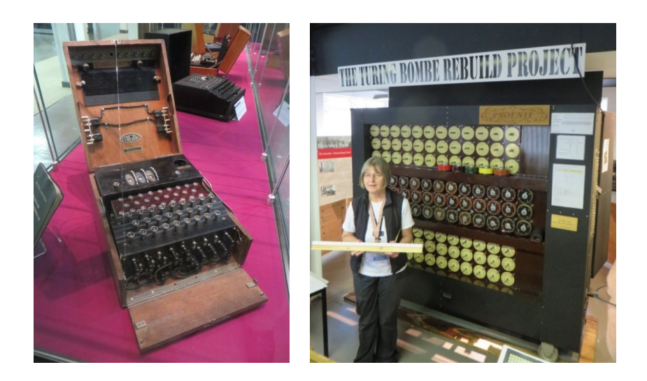
Fig. 2. A German Enigma machine (left) and the Turing Bombe rebuild project (right) at Bletchley Park.

mechanically, far more quickly and reliably than a human (or even a team of humans) was able to do so.