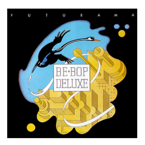
Figure 2. Be Bop Deluxe album, Futurama. EMI Records, 1975.