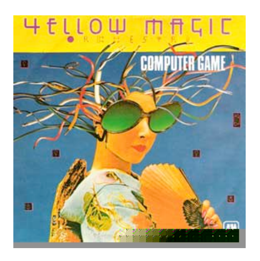
Figure 3. Yellow Magic Orchestra single, 'Computer Game (Theme from the Invaders)'. A&M Records, 1980.

A baffled Washington Post critic reviewing a Yellow Magic Orchestra concert in 1979 described it as follows: "Transistorized Tchaikovsky, Diode Disco, Robot Rock ... [YMO] preferred to let their gadgets do their work for them ... at times, it wasn't clear whether the men were playing the machines or vice versa." Both the tone of the comments and the choice of words, such as 'transistorized' and 'robot', allude to what Morley and Robbins<sup>20</sup> referred to as a 'Japan Panic' in the USA in the late 1970s and 1980s. But they also provide a reminder that, "throughout this century of rapid technological change, the drive of modernism has been harnessed to the dances and songs of machines."<sup>21</sup> This was a drive that accelerated in the second half of the twentieth century when the dance became more frenetic due to the increasing number of machines and their enhanced capabilities.