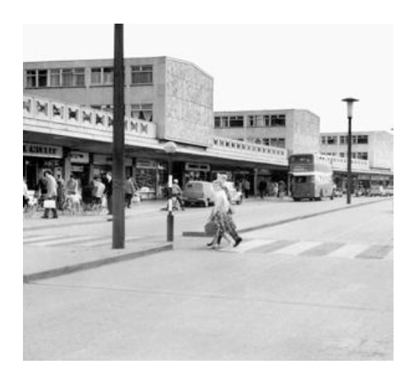
Figure 1. Southernhay, Basildon. c. 1965. Featured in the booklet to Yazoo's CD box set In Your Room . Mute Records, 2008.

Music was one way of dealing with the 70s realities of life in Basildon for those born in the 60s. Imagine being a certain teenager in 1977 Basildon when all at once there was disco, punk... Star Wars , Parliament and Abba: imagine processing all that information – 'Anarchy', 'Stayin' Alive'... robots, bleeps and space ships – all at the same time. You could only do it using machines.<sup>10</sup>